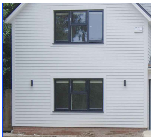
Horizontal weatherboard to rear and side elevations above brickwork