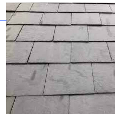
Natural slate roof finish