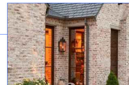
Ground floor facade in facing brickwork