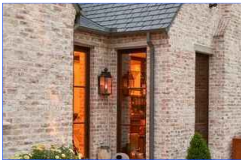
Ground floor facade in facing brickwork