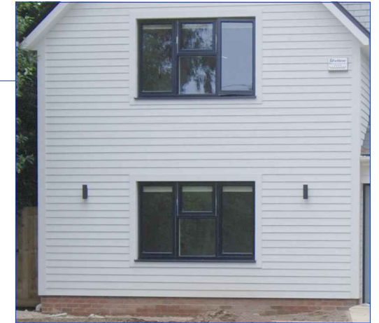
Horizontal weatherboard to rear and side elevations above brickwork

This drawing is the copyright of Arid design ltd and may not be altered or reproduced in any way without written permission