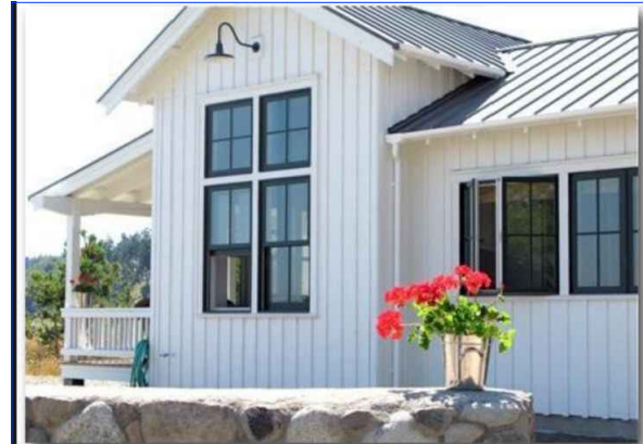
Dark aluminium/upvc windows

White board and batten cladding to gable, with roof overhang and return south wall to project beyond main building line to provide privacy and protection for the balcony. Oak posts, beam and braces to form balcony