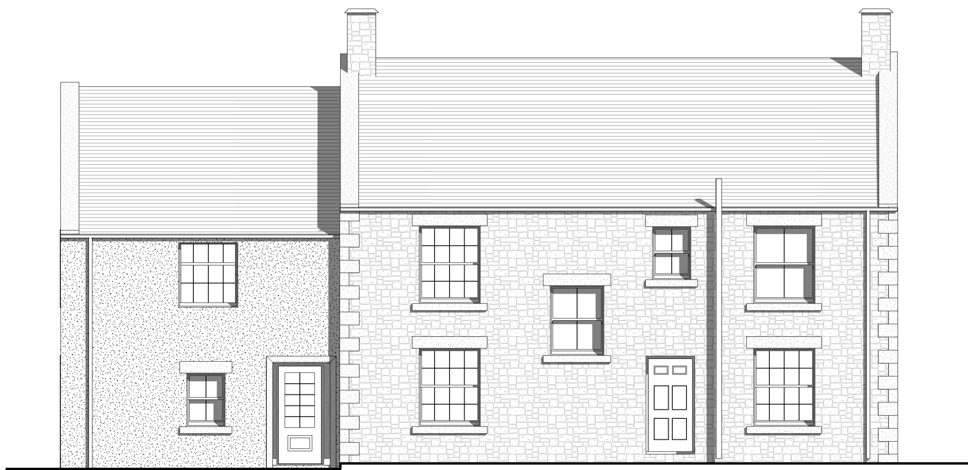
2 03.A1 EXISTING NORTH ELEVATION 1 : 50