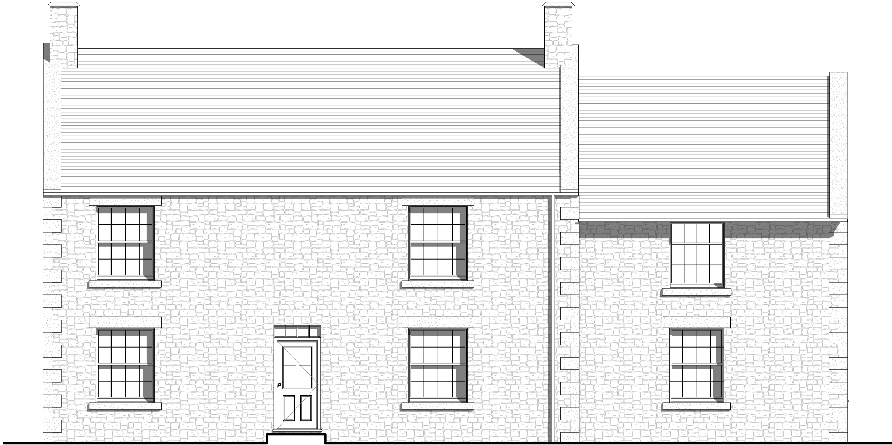
3 03.A1 EXISTING SOUTH ELEVATION 1 : 50