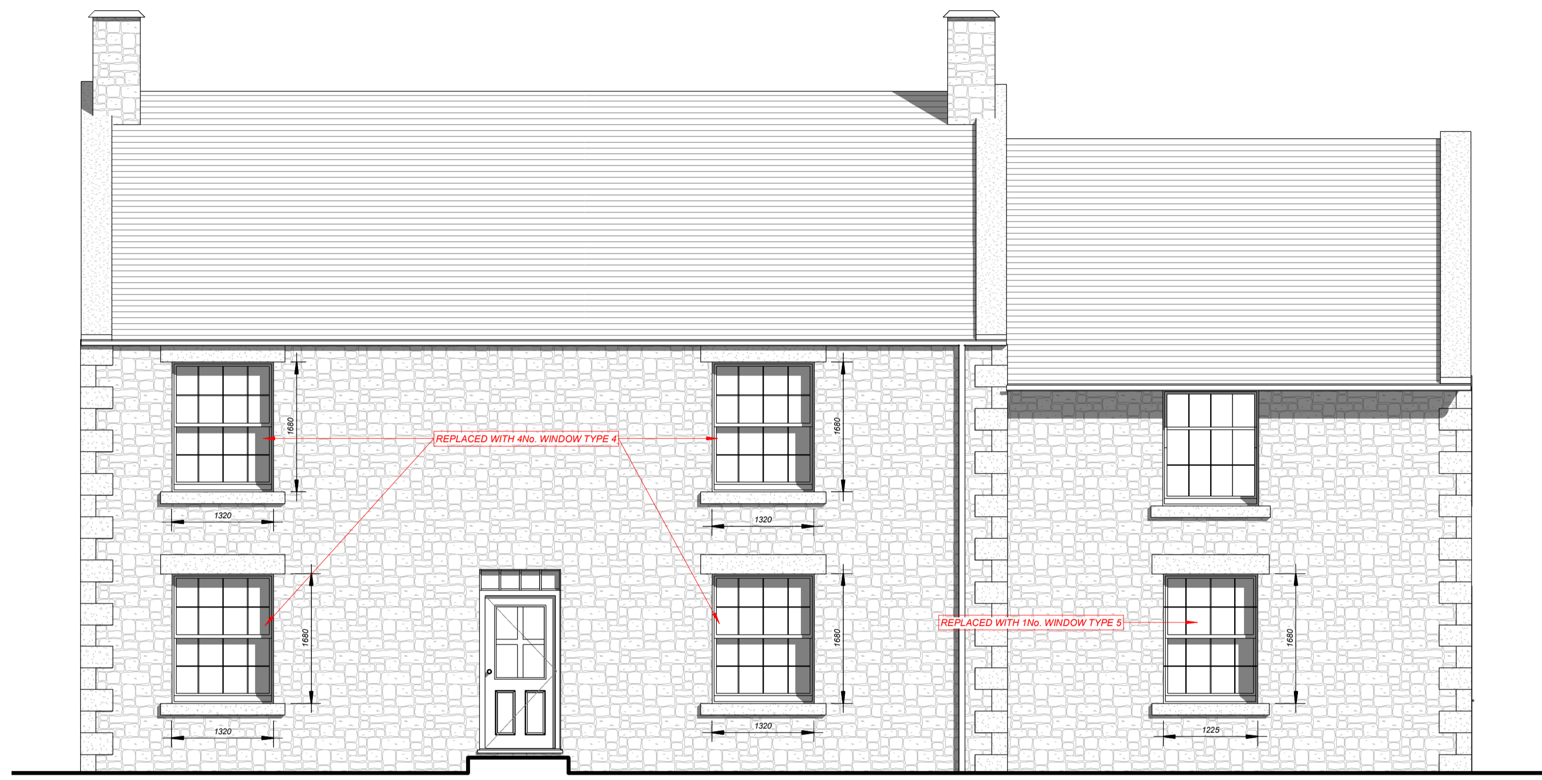
1 04.A1 PROPOSED SOUTH ELEVATION 1 : 50