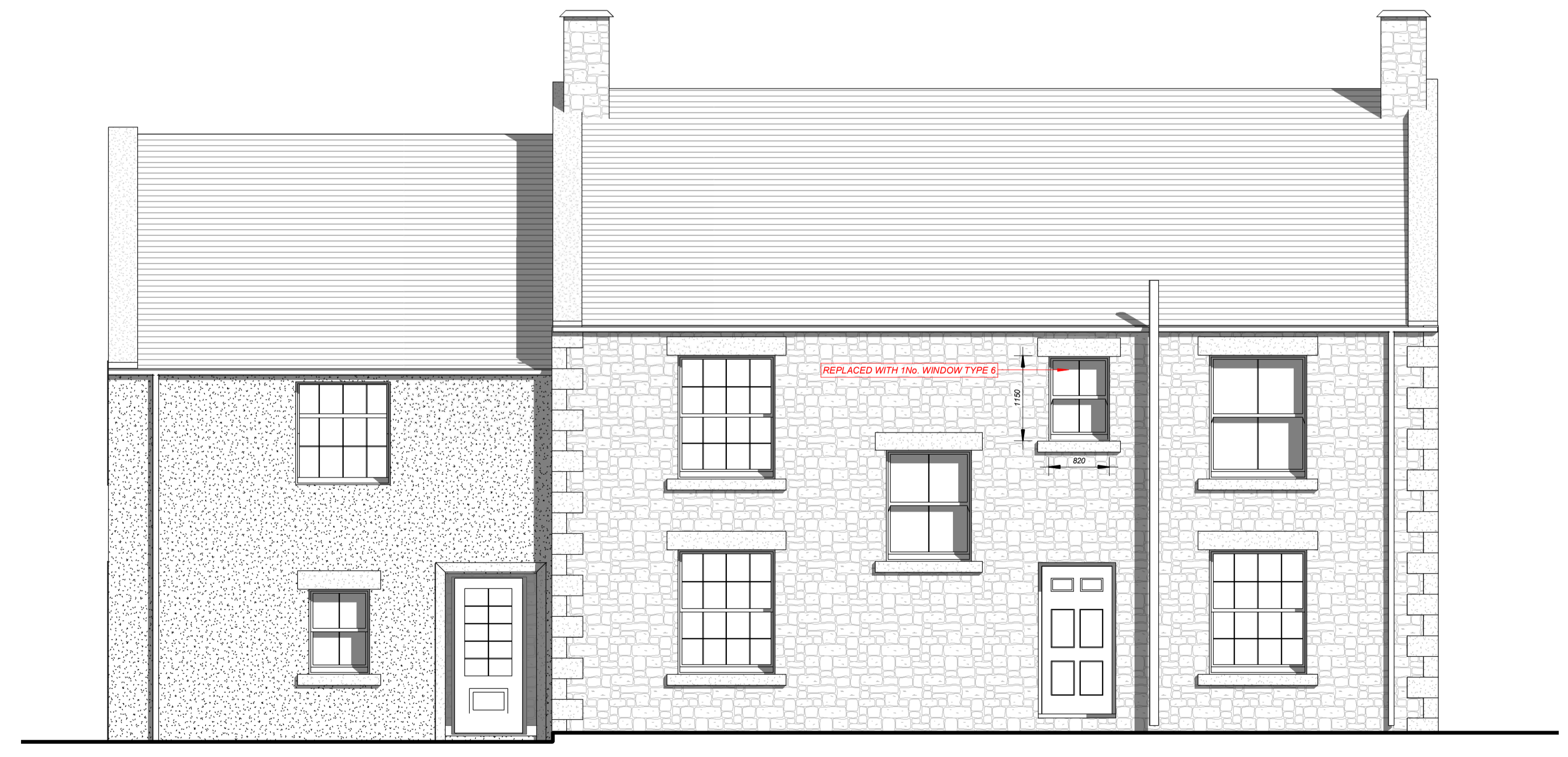
4 04.A1 PROPOSED NORTH ELEVATION 1 : 50