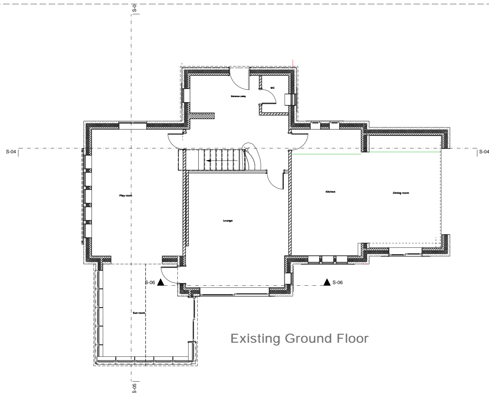
Existing Ground Floor