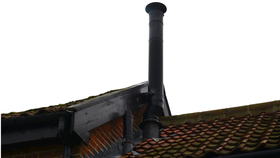
(Existing dwelling flue).

-Shieldmaster or similar approved to match existing.