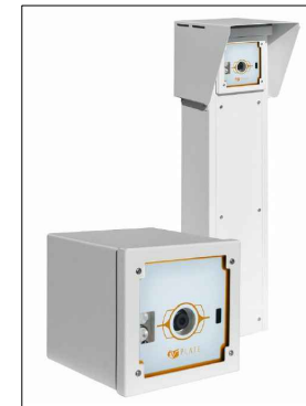
ANPR camera and housing; 200x200x520mm high.