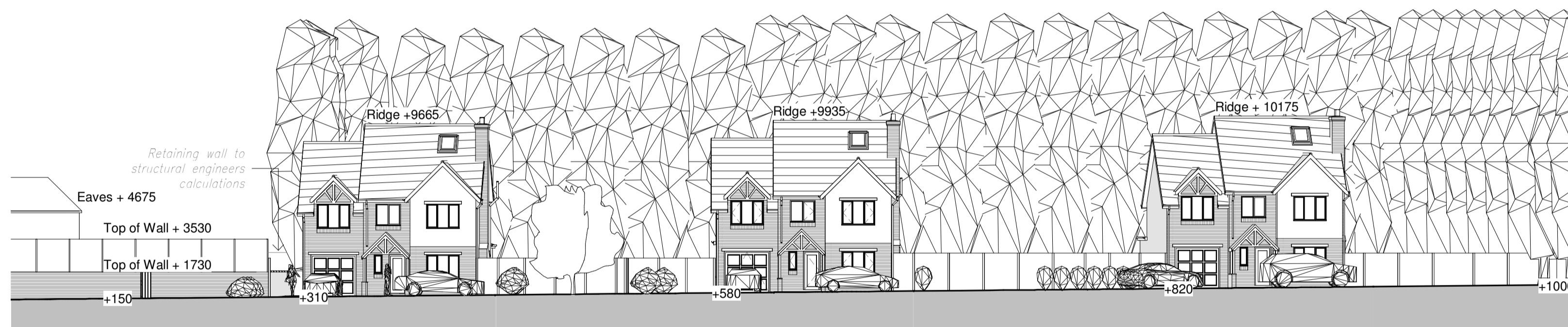
Section AA 1 : 200