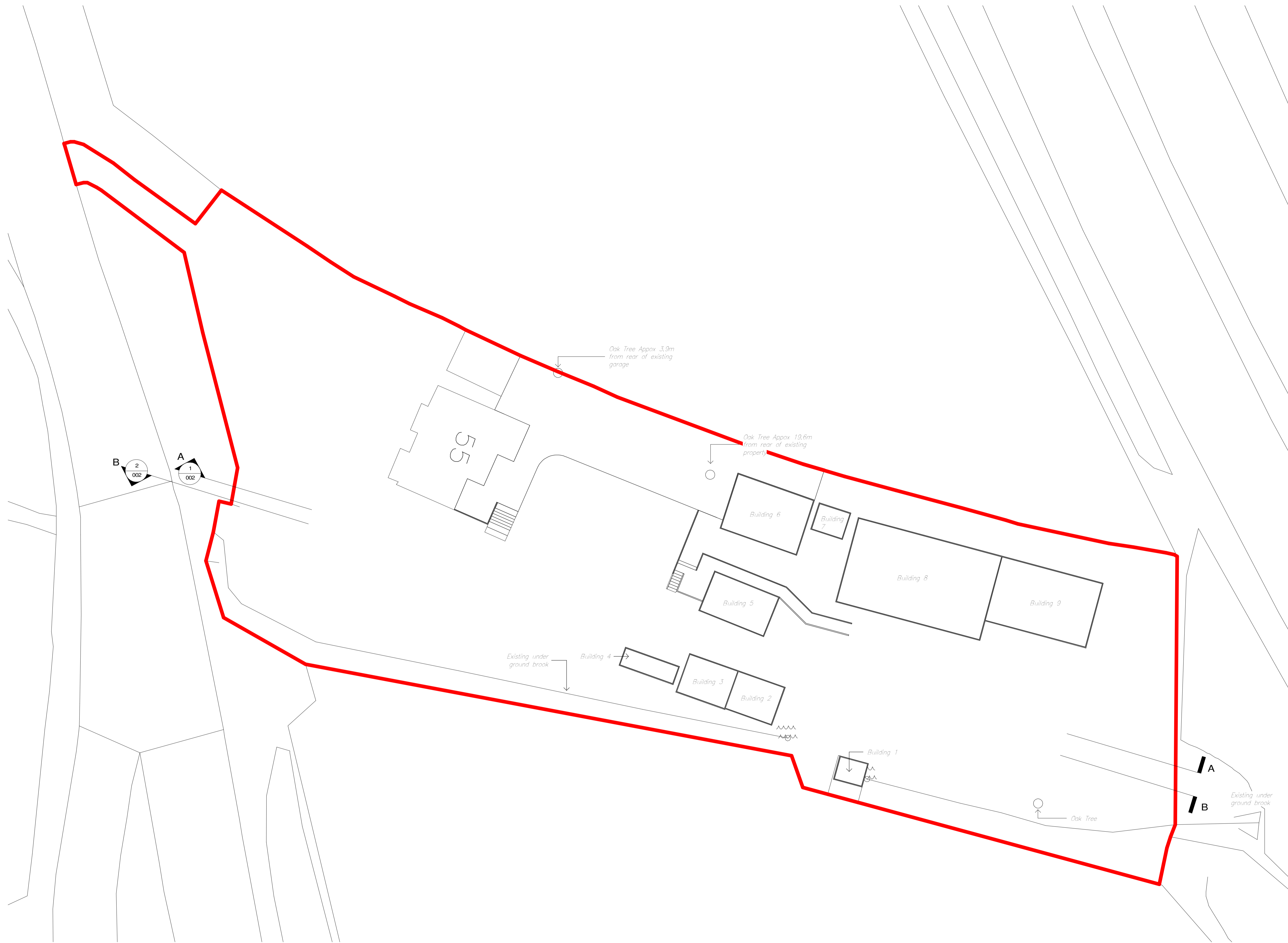
Ground Floor Plan 1 : 200