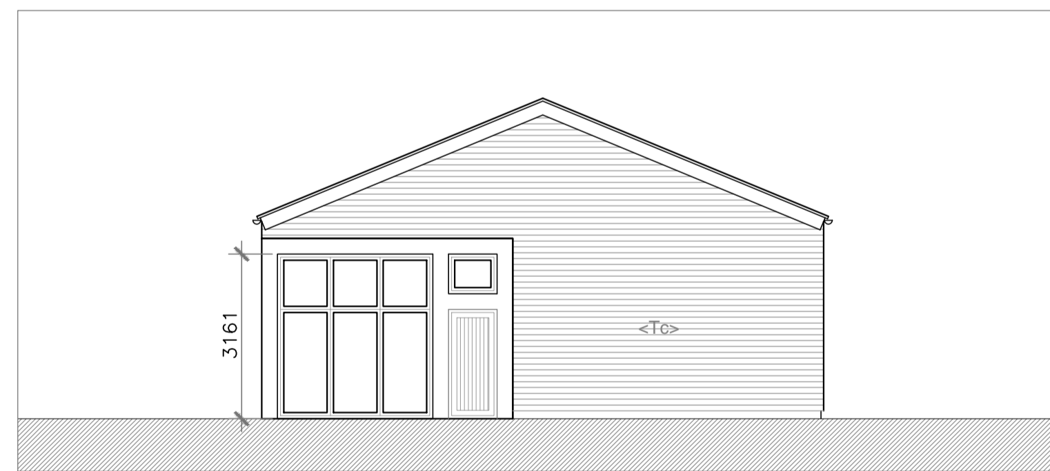
Proposed North Elevation 1:100