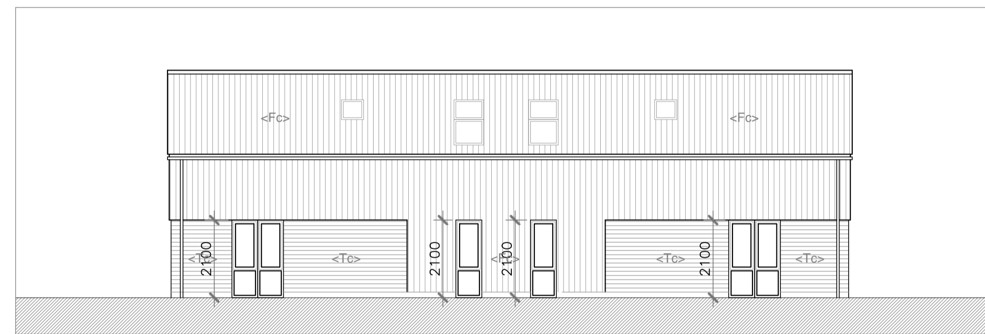
Proposed West Elevation 1:100