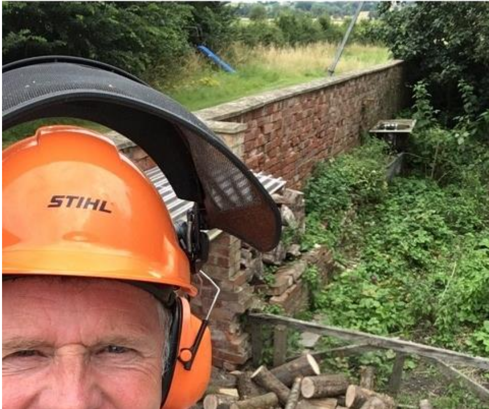
Photograph 7 – 2016: wood store within former barn located adjacent to polytunnel with children’s play equipment visible in background (north-eastern corner of site).