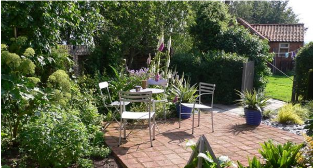
Photograph 5 – 2009: formal garden within original dwelling curtilage. Gate evident leading to application site with washing line attached to garage.