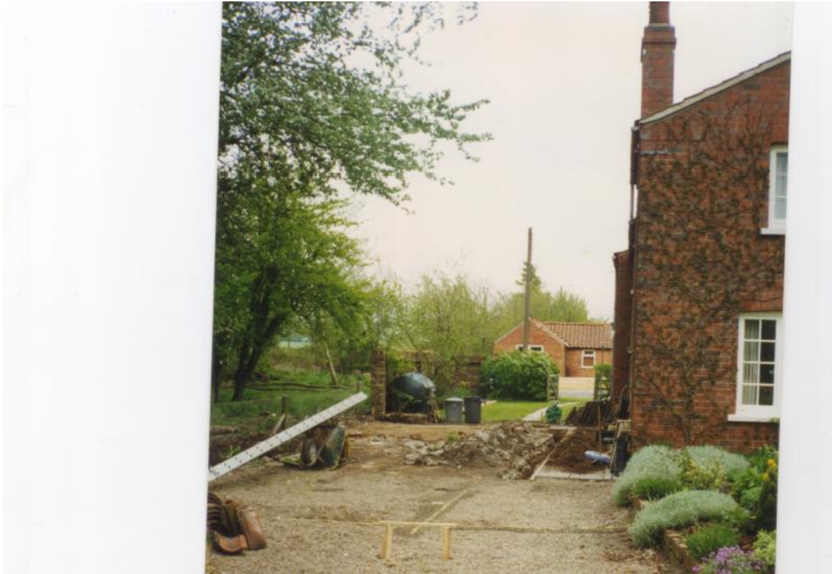
Photograph 1 – 1997: site of dwelling extension with gate between formal garden and application site/garage visible to rear. Evidence to woodland trail/fencing evident in copse periphery to left of image.