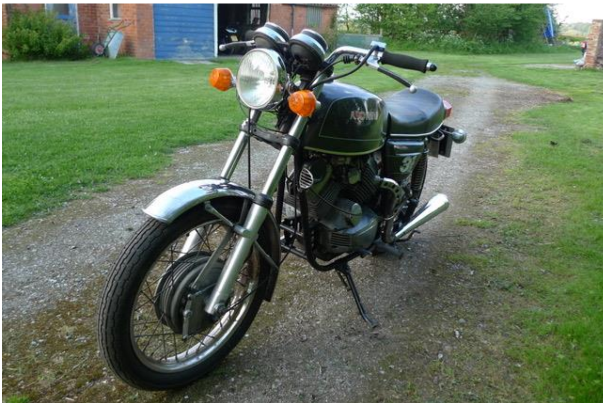
Photograph 6 – 2013: depicting garage use of outbuilding. Site clearly host to lawn with children's play equipment evident within top right of image.