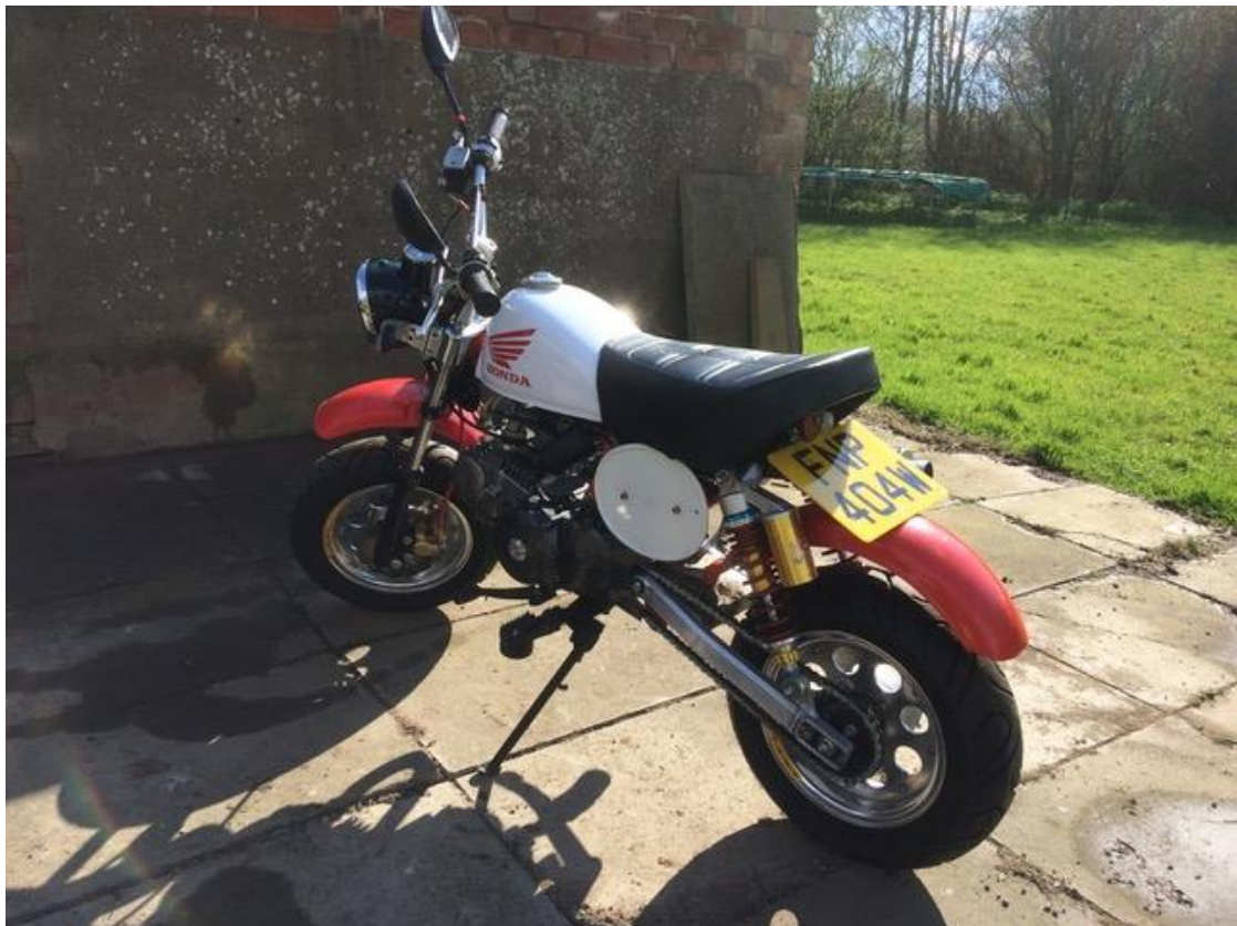
Photograph 8 – 2016: domestic use of part of former barn located in site’s south-eastern confines. Trampoline visible in background (adjacent to site’s southern boundary).