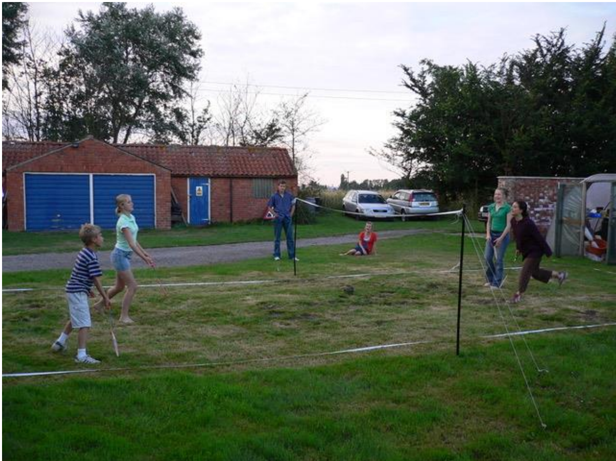
Photograph 4 – 2007: land used as garden to south of garage (evident in background) and west of polytunnel (right of image).