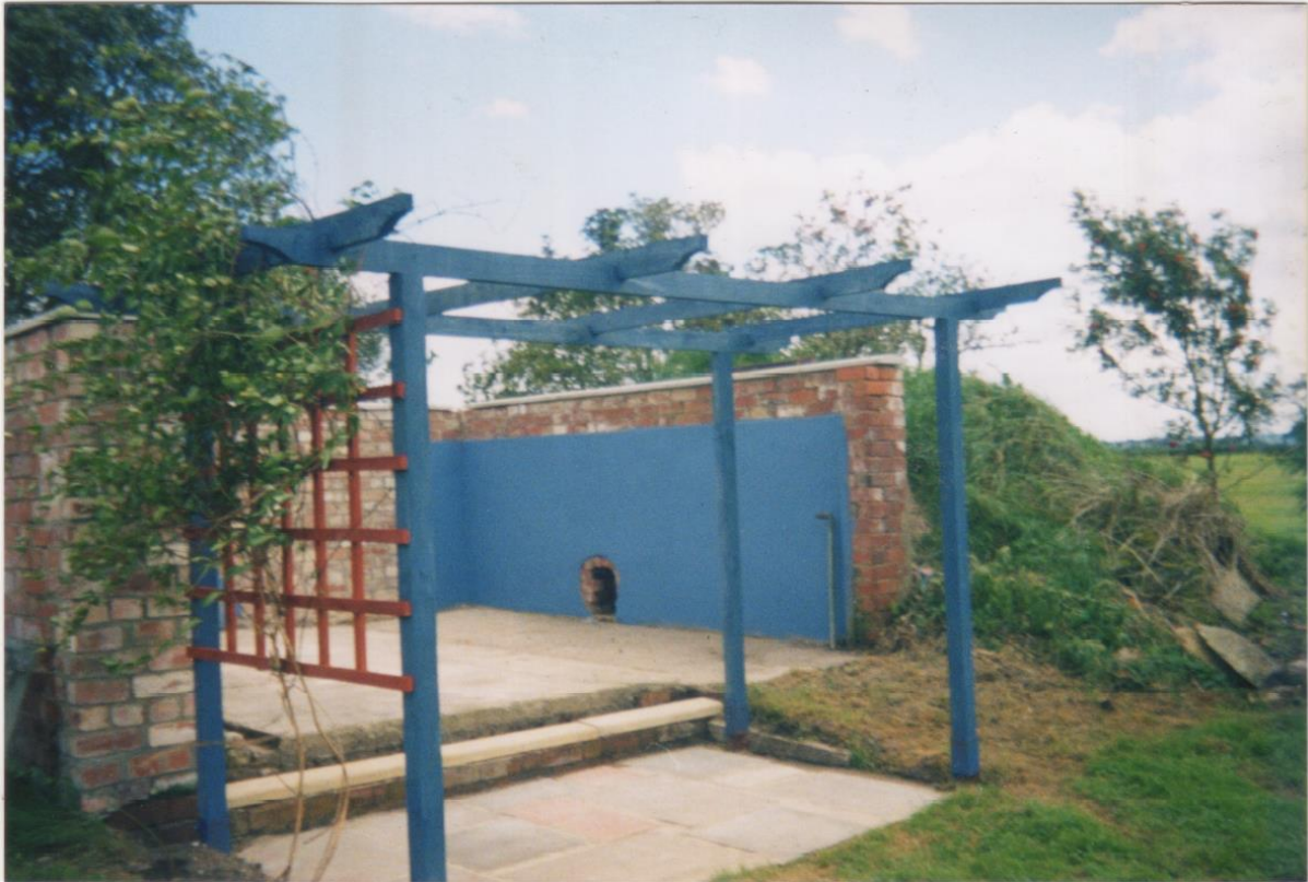
Photograph 3 – 2007: depicting completed BBQ area and pergola in section of former barn adjacent to polytunnel.