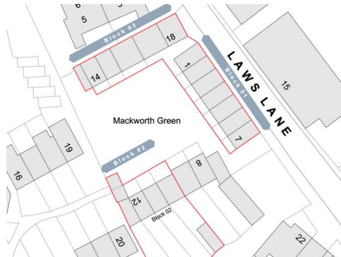
Mackworth Green | Site Plan