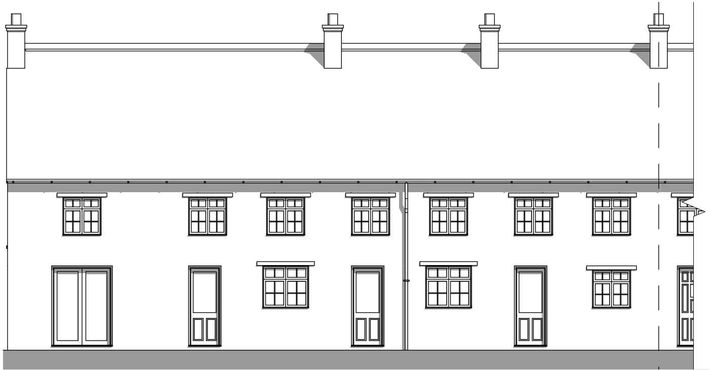
Rear Elevation Scale: 1:100