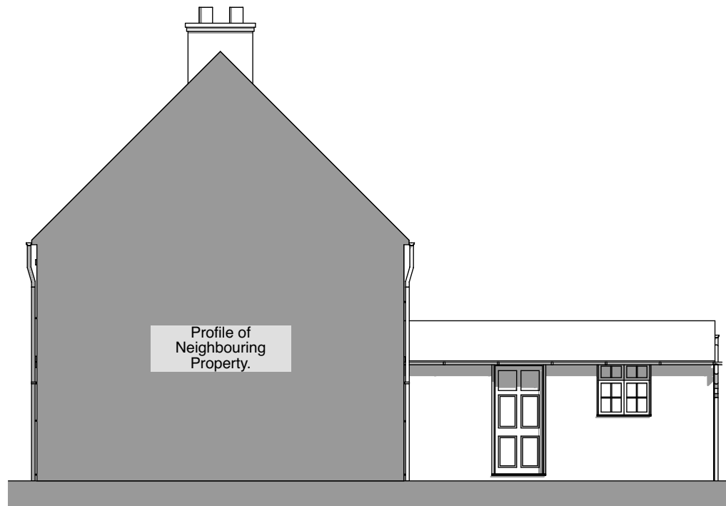
Side Elevation Scale: 1:100