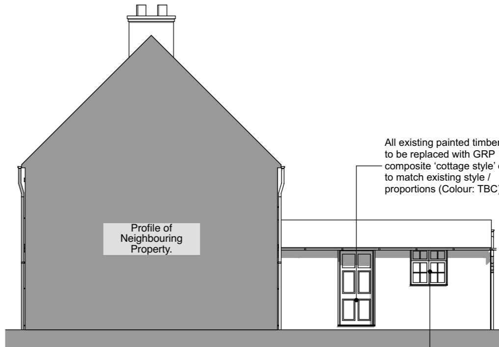
Side Elevation Scale: 1:100

All existing painted timber doors to be replaced with new painted timber doors to match existing style / proportions (Colour: TBC)