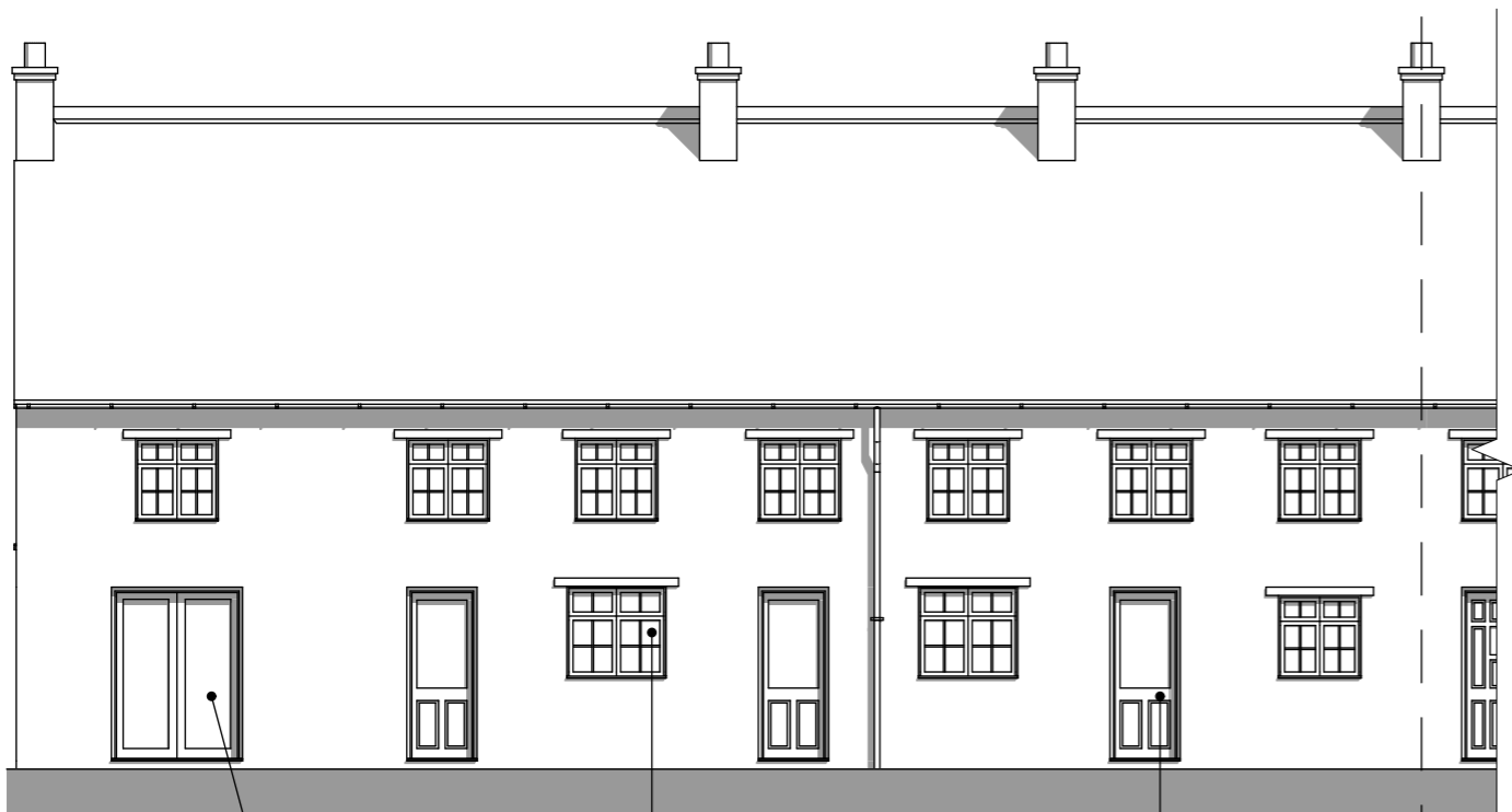
Rear Elevation Scale: 1:100

All existing painted single-glazed timber windows to be replaced with double-glazed painted timber windows to match existing style / proportions (Colour: White)