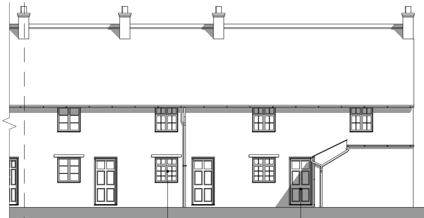
Front Elevation Scale: 1:100

All existing painted single-glazed timber windows to be replaced with double-glazed painted timber windows to match existing style / proportions (Colour: White)