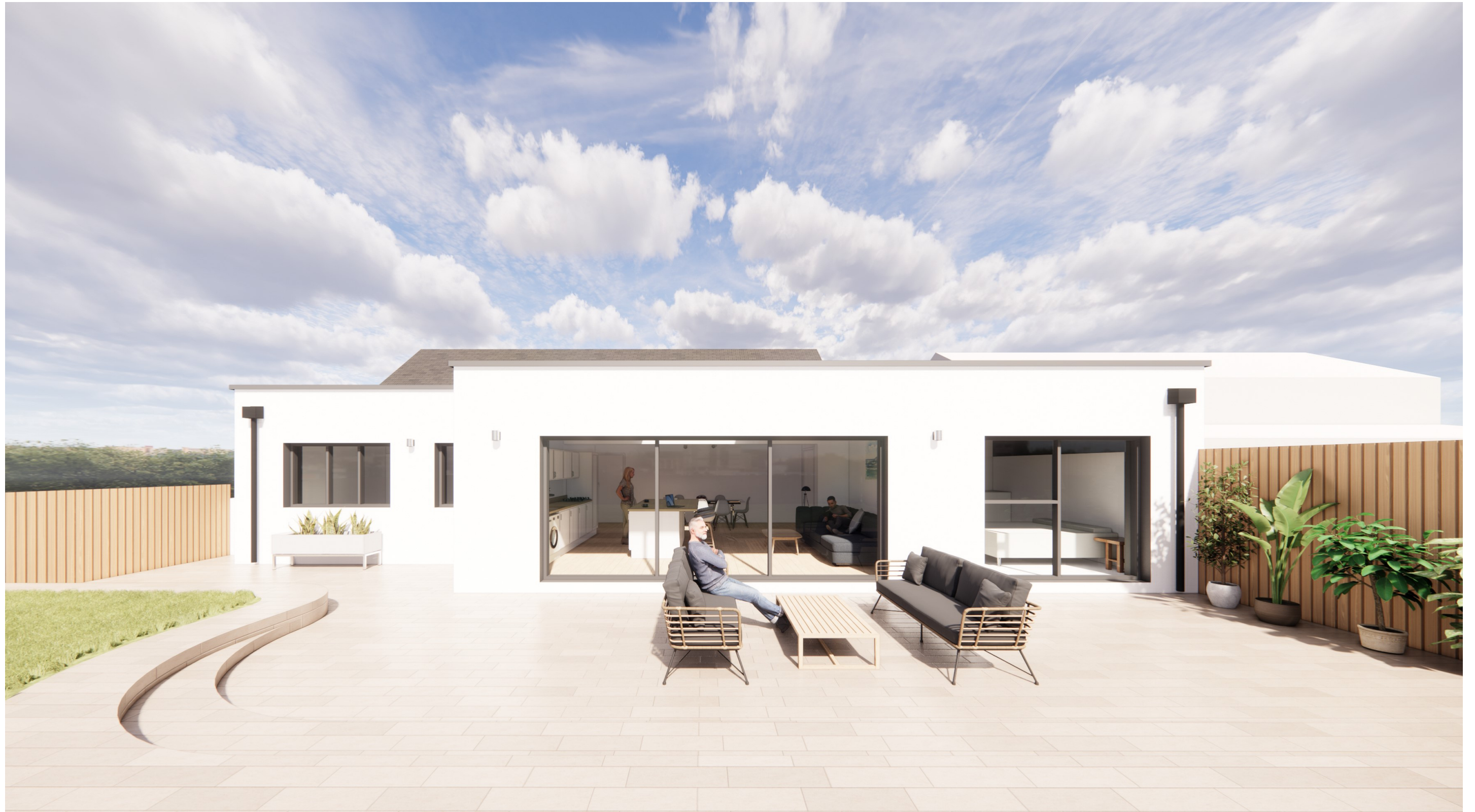
Perspective View From the Garden