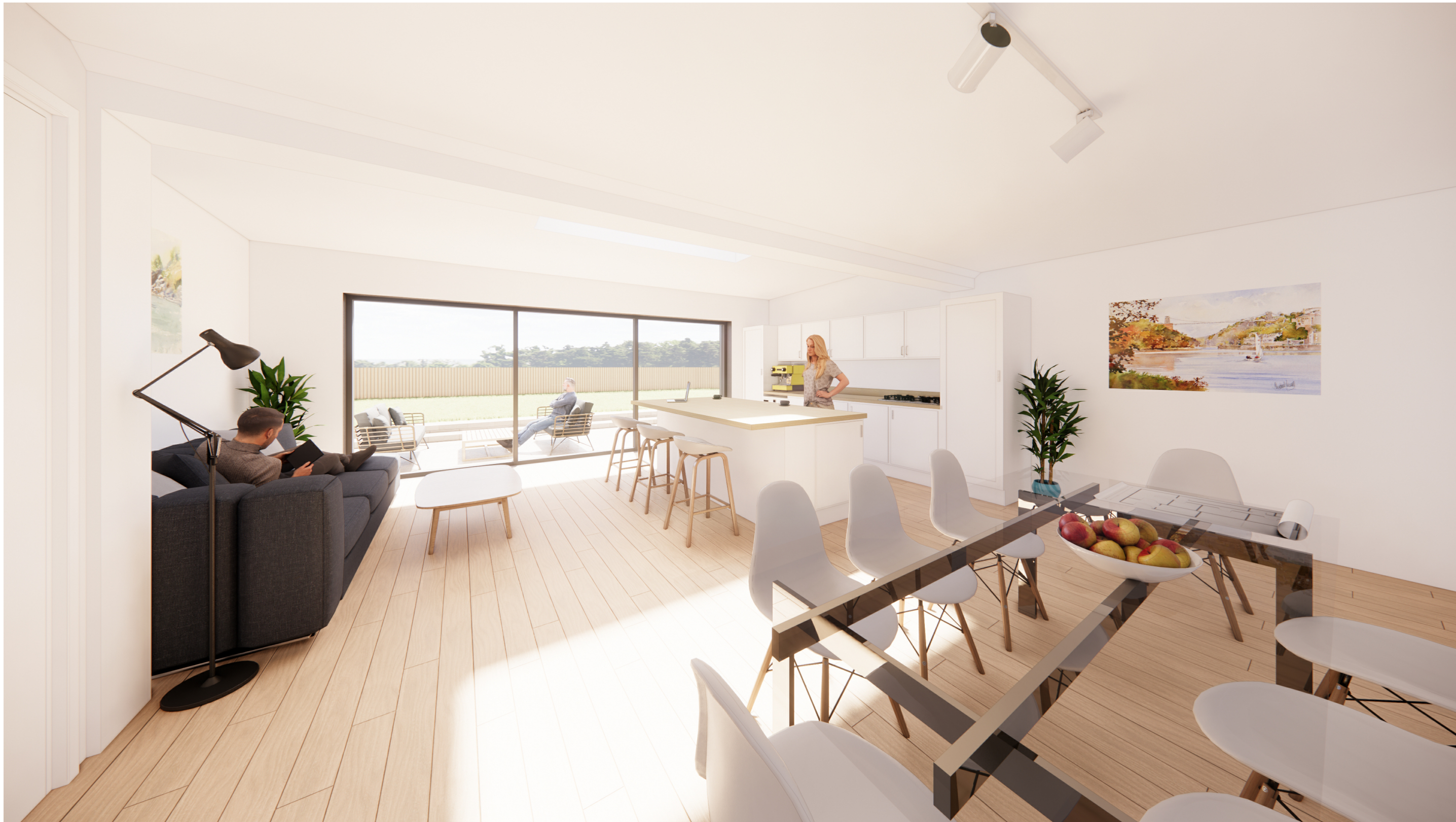
Perspective View in the Kitchen and Dining Room