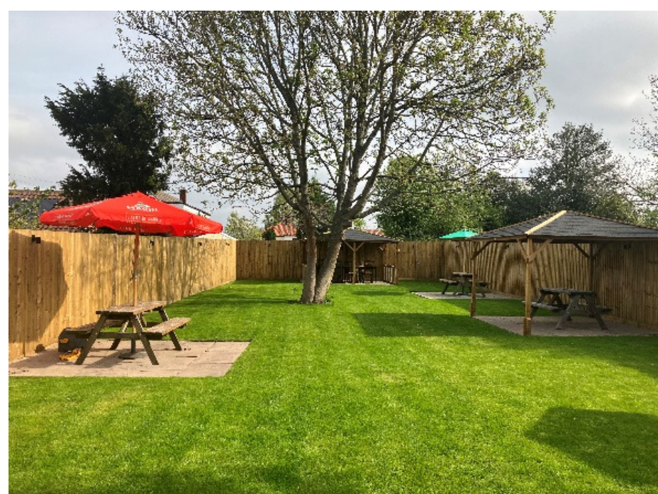
General View (to North East) – Garden (Outside Seating Area) to Rear