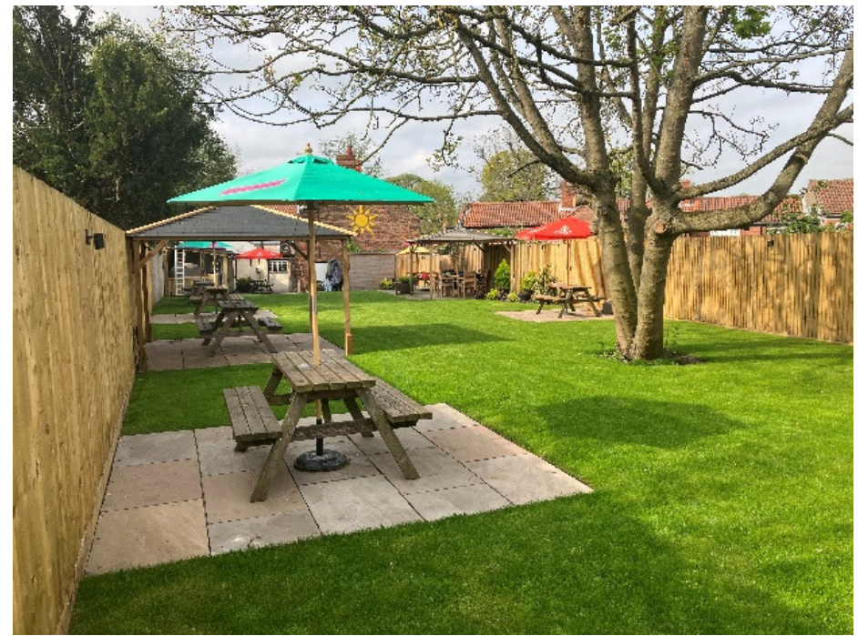
General View (to South West) – Garden (Outside Seating Area) to Rear