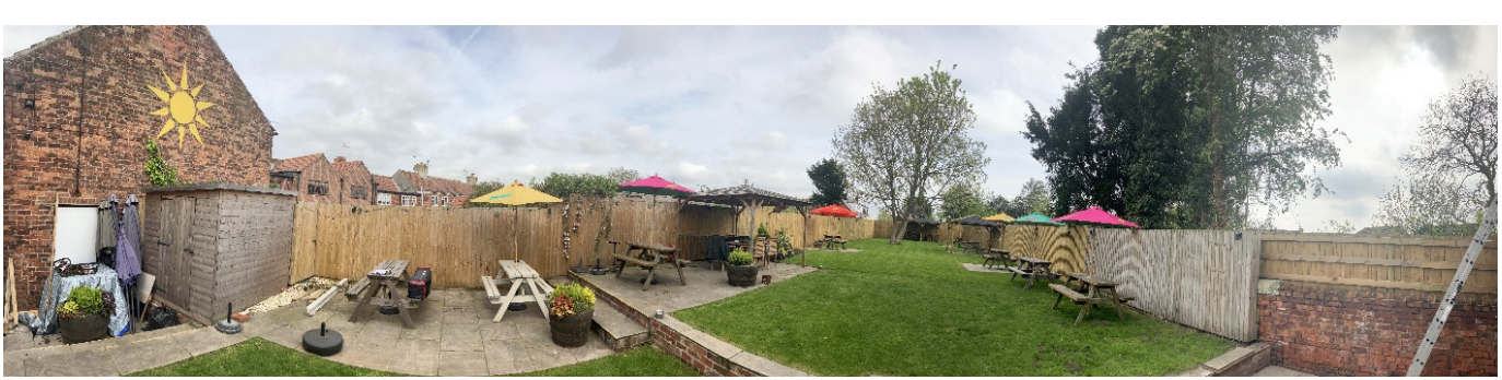
General View – Garden Terrace (Outside Seating Area) to Rear