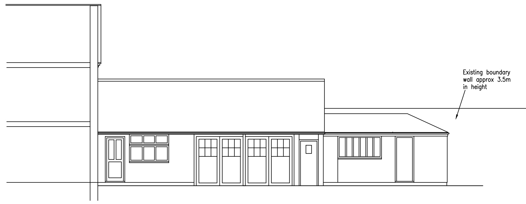
Existing elevation A