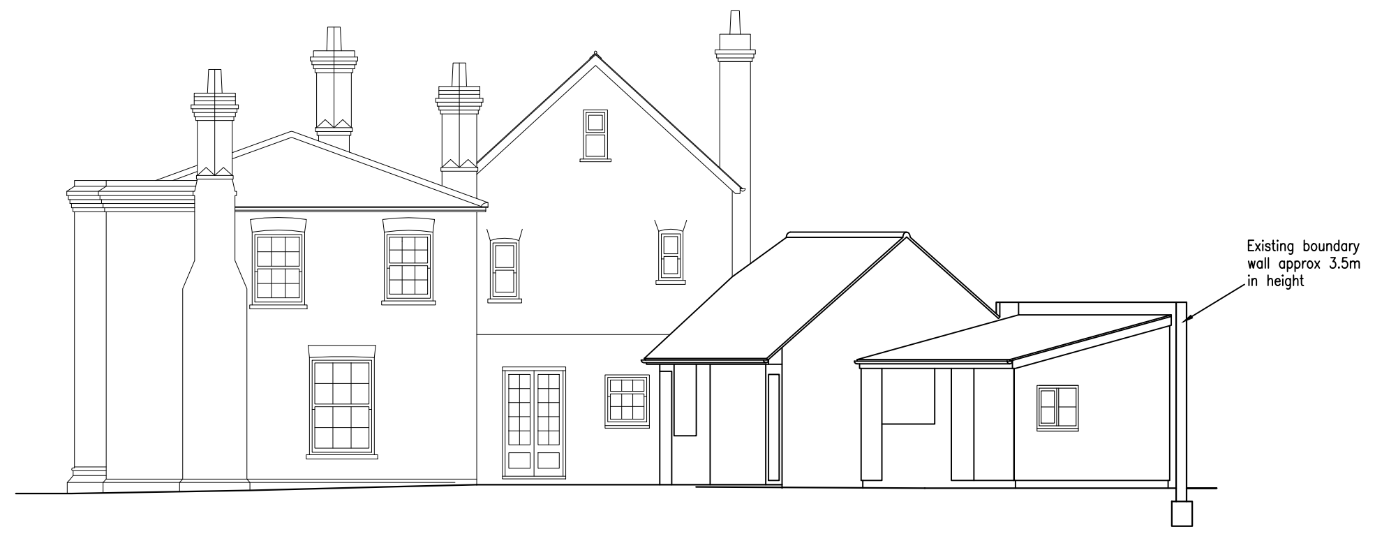
Existing elevation B