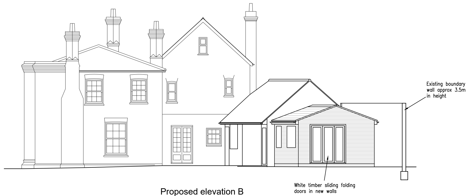
Proposed elevation B