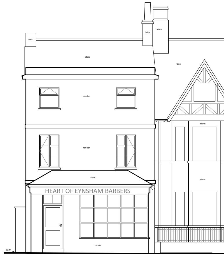
1 Existing south elevation Scale: 1:100