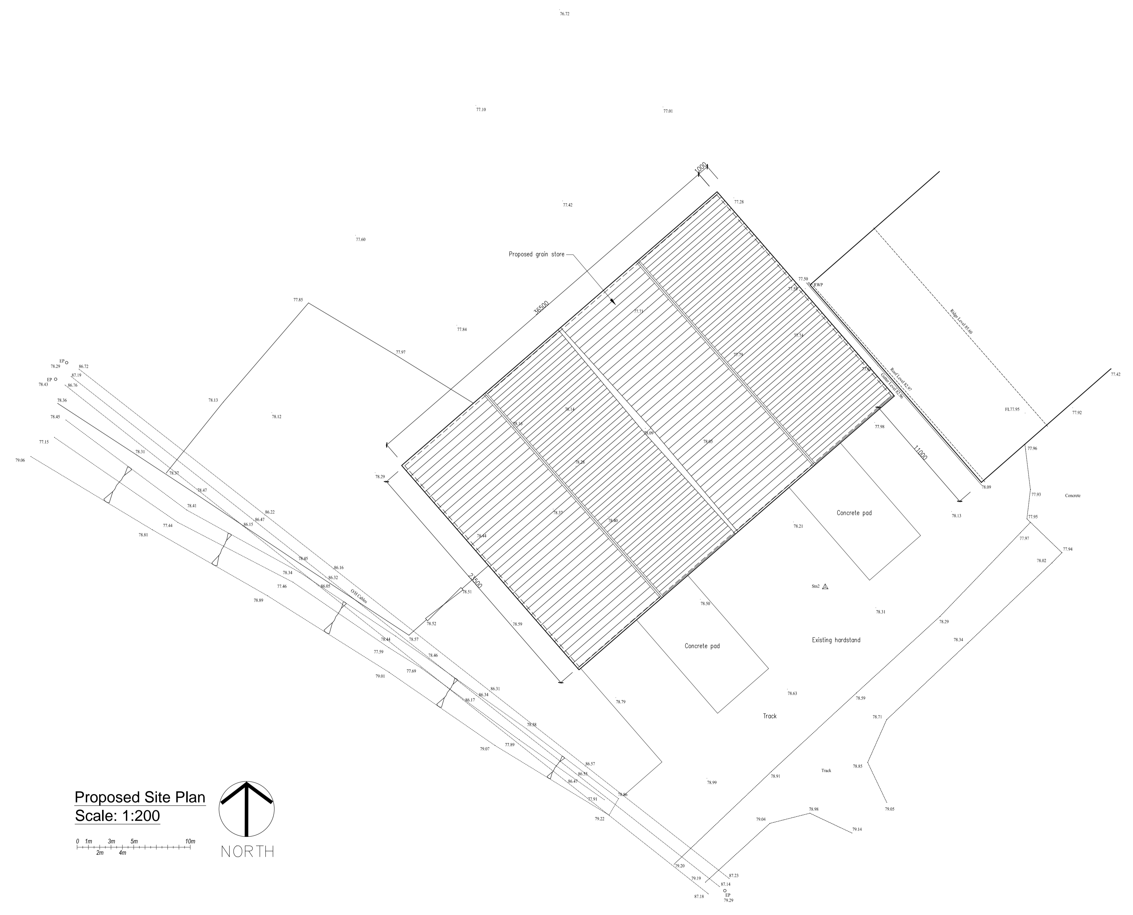
Proposed Site Plan Scale: 1:200 0 1m 2m 3m 4m 5m 10m NORTH