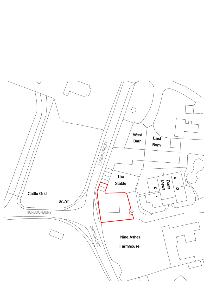
LOCATION PLAN 1 : 1250 @A3