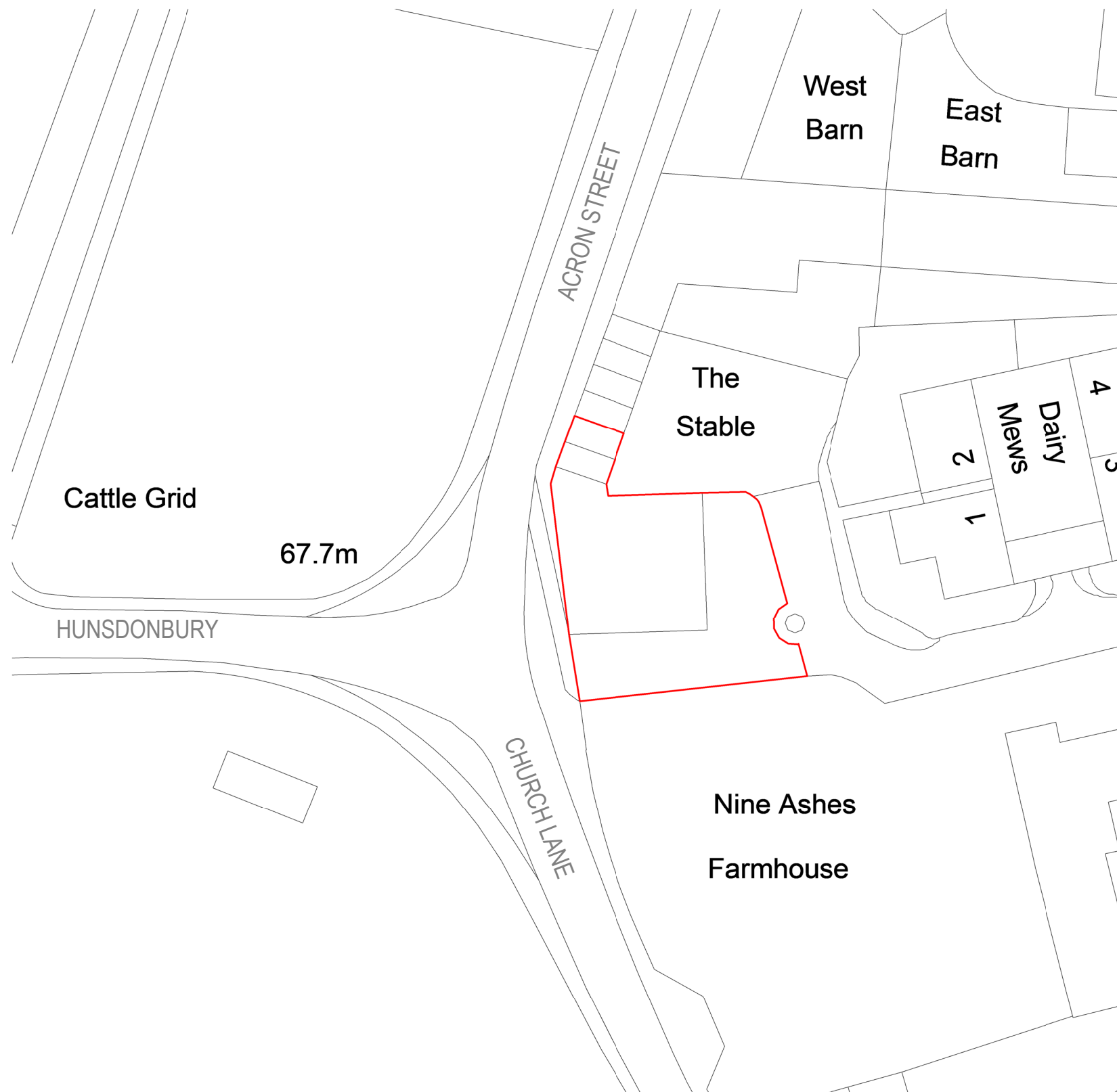
BLOCK PLAN 1 : 500 @A3