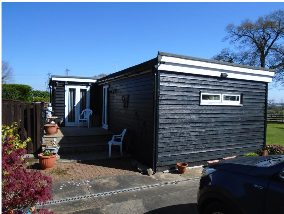
Photograph by Roger Spring 2023