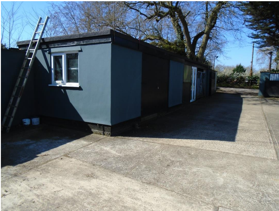
Photograph by Roger Spring 2023