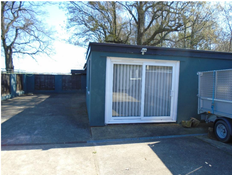
Photograph by Roger Spring 2023