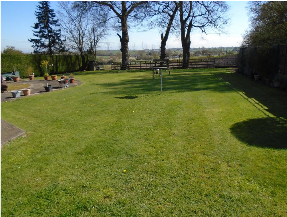
Photograph by Roger Spring 2023