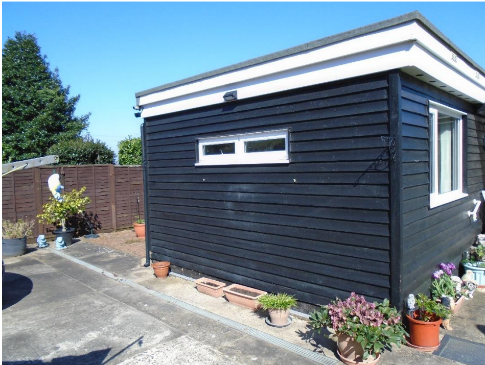
Photograph by Roger Spring 2023