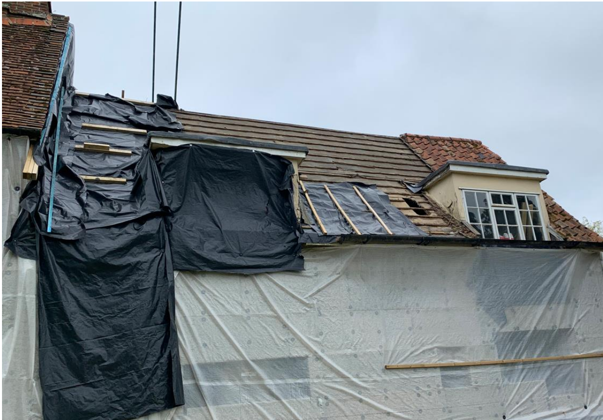
Front Roof Slope

As works have been commenced these need to progress without delay to ensure structural integrity and stability of the building is maintained together with weather protection of the interior.