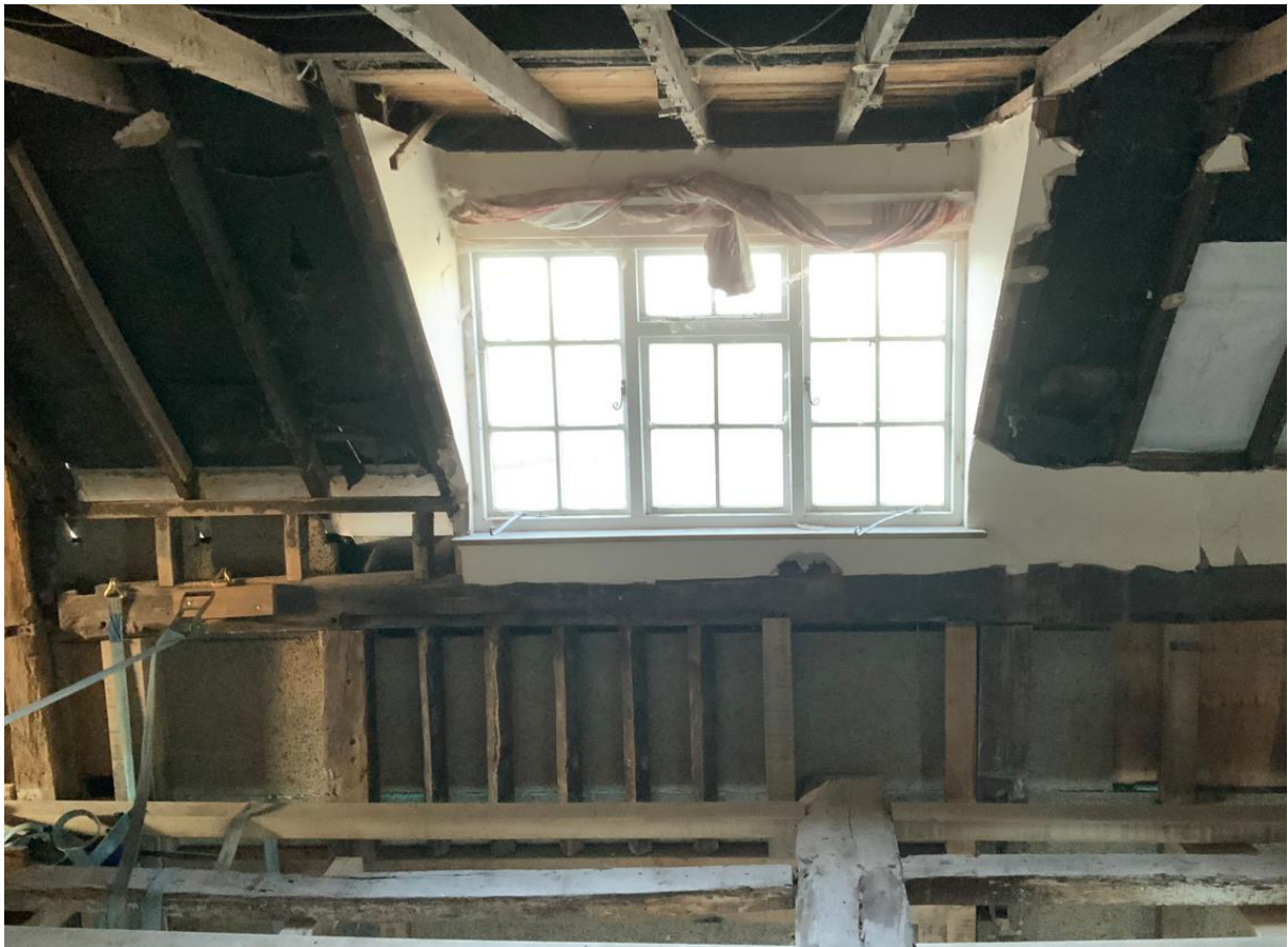
Rear elevation, showing roof make up and original mullioned window