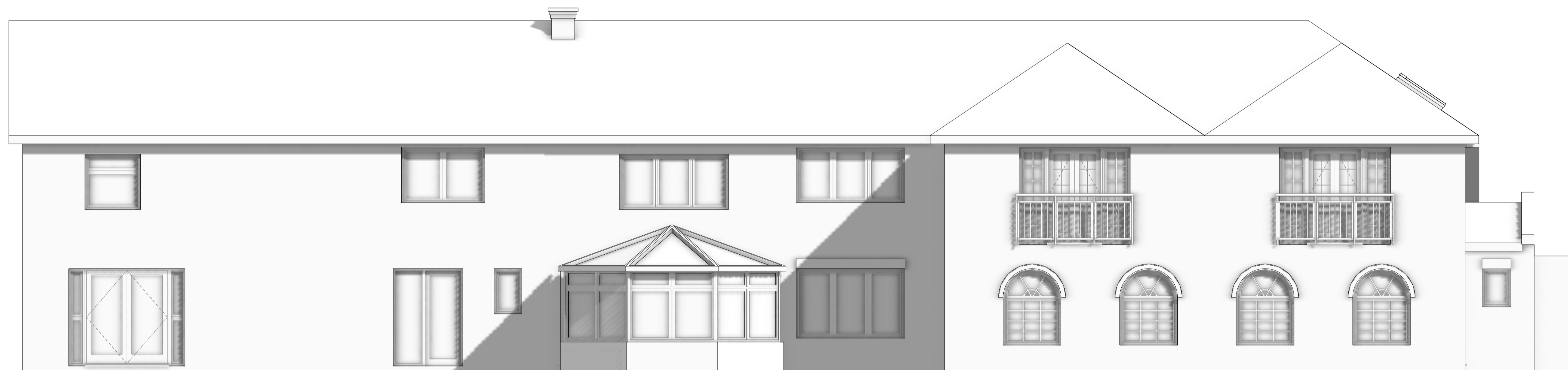
03 REAR (NORTH) ELEVATION PL-04 Scale: 1:50