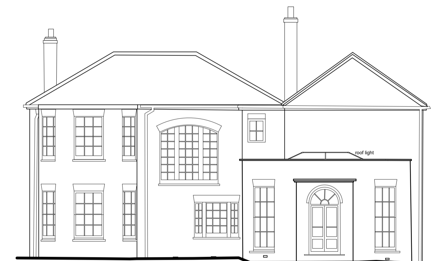
west (side) elevation main dwelling