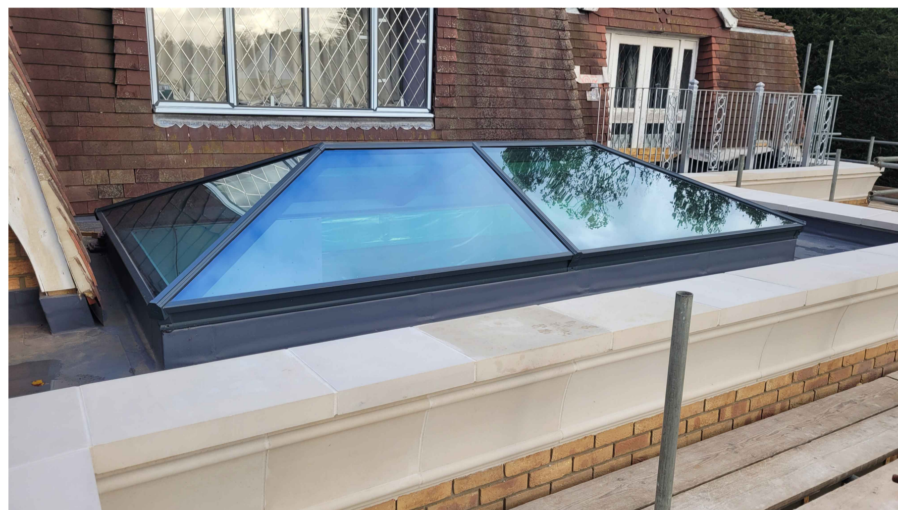
proposed roof lantern example