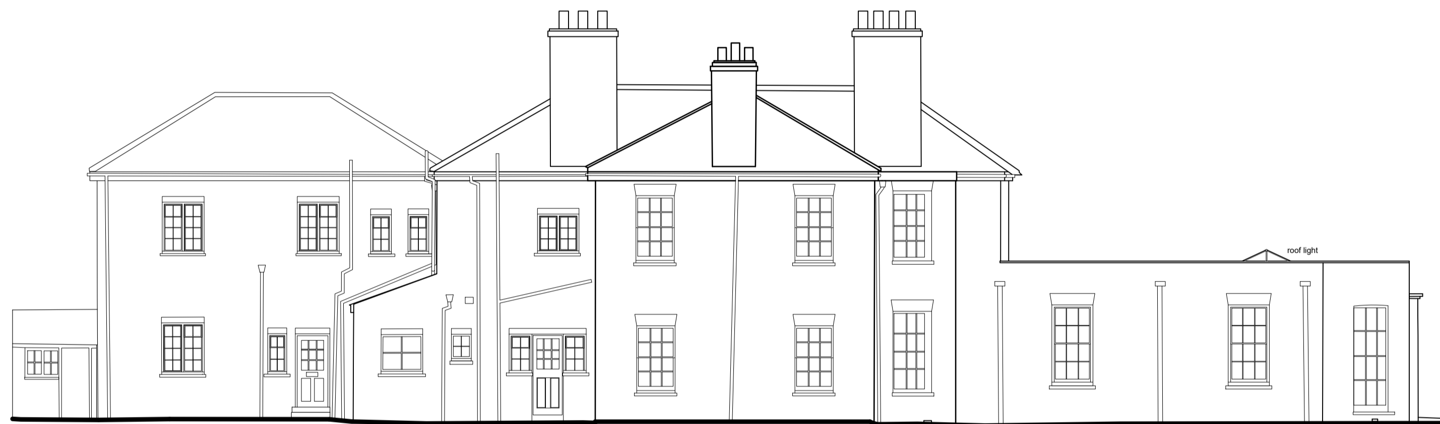
north (rear) elevation main dwelling