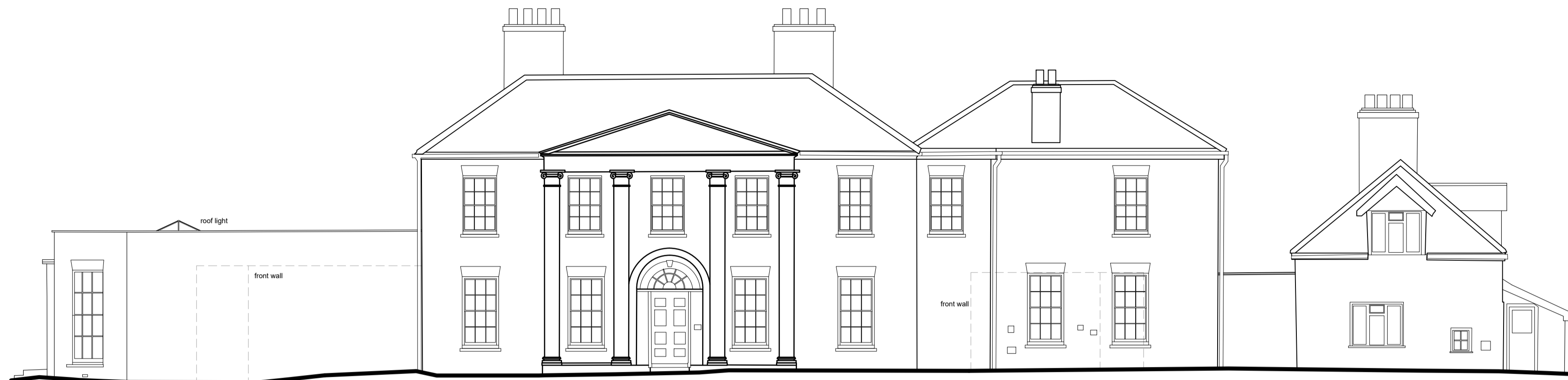
south (front) elevation