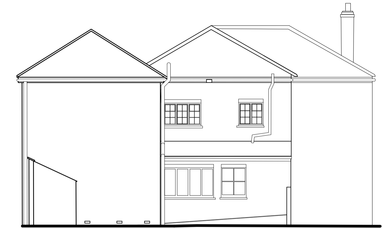
east (side) elevation main dwelling