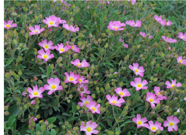
Cistus x lenis