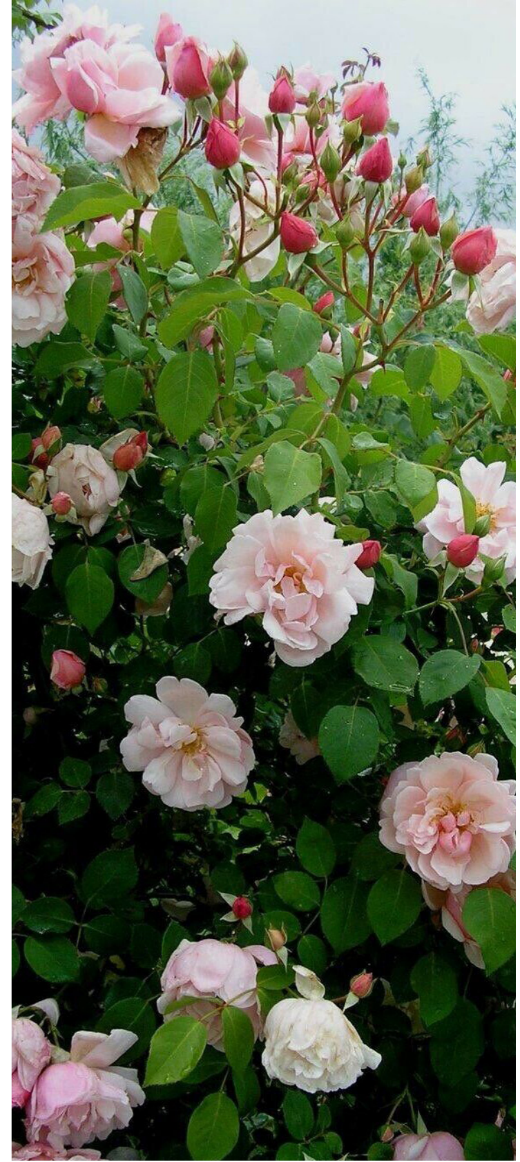
Rosa 'Cecile Brunner'