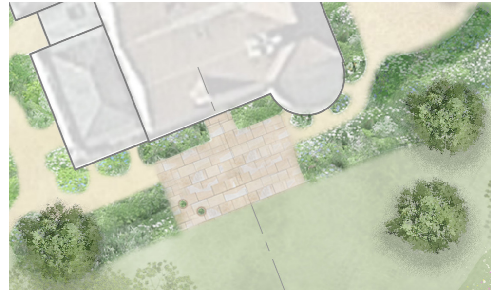
Reference images - proposed planting around the Main Terrace (TSS projects)