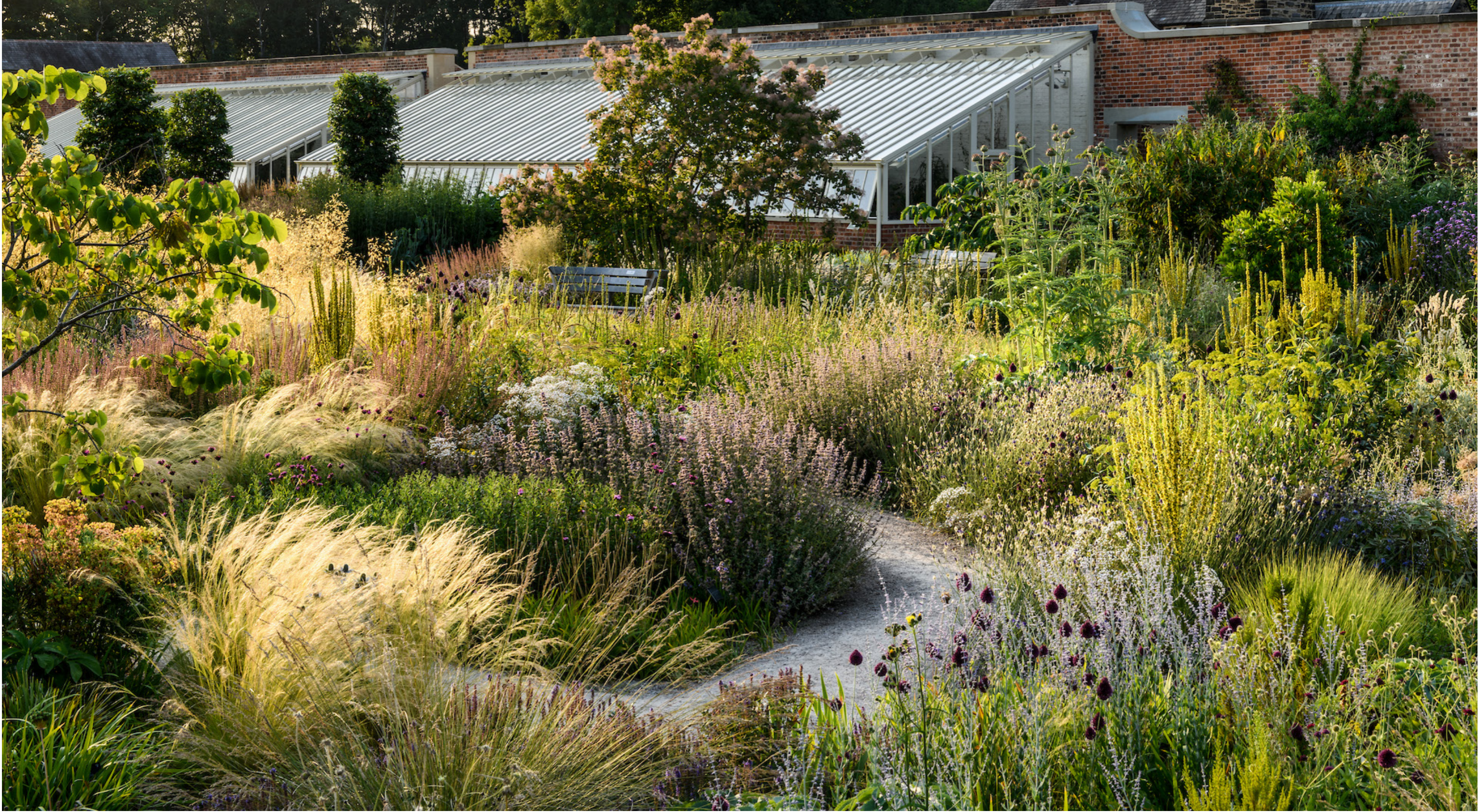
Reference image - walled gravel garden with glasshouse (TSS project, RHS Bridgewater)