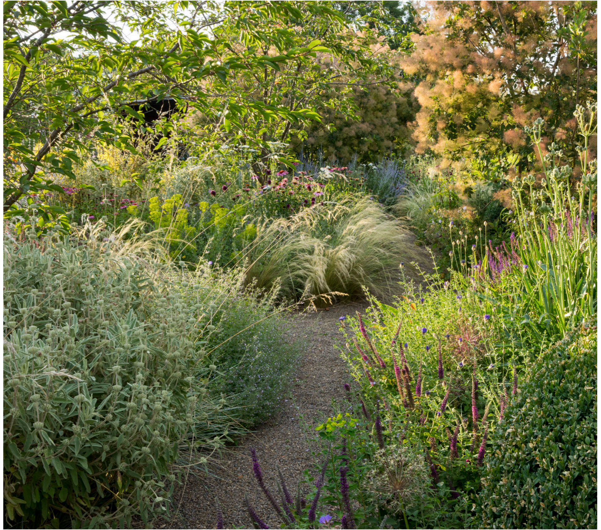
Reference images - gravel garden planting precedents (TSS projects)