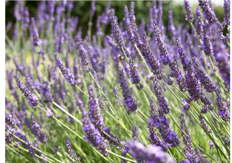
Lavendula x intermedia