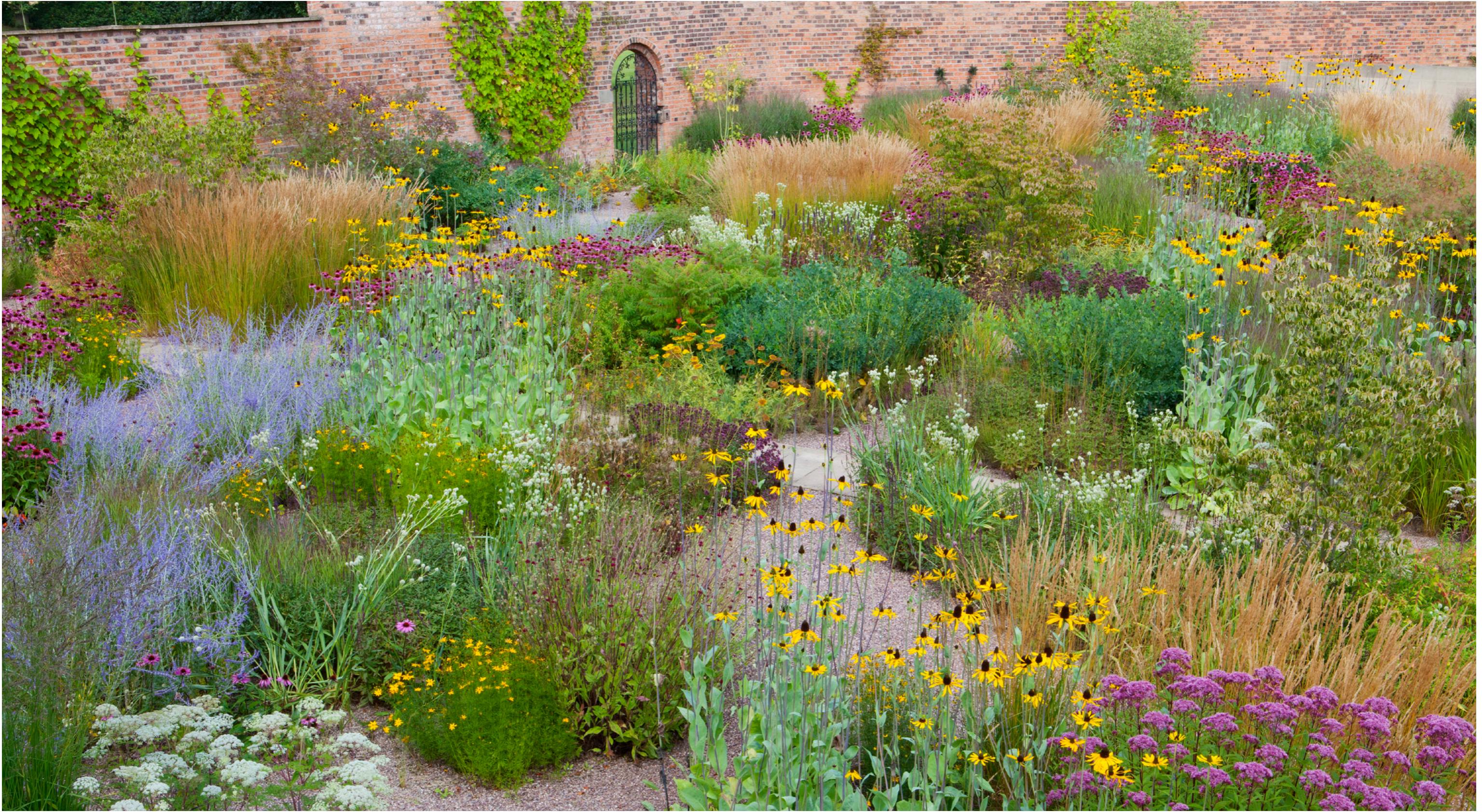
Reference image - walled gravel garden herbaeous planting (TSS project)