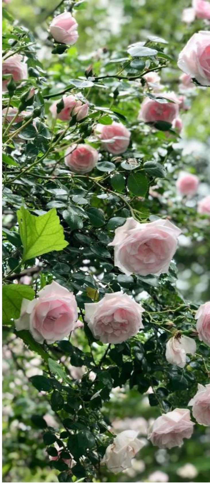
Rosa 'New Dawn'