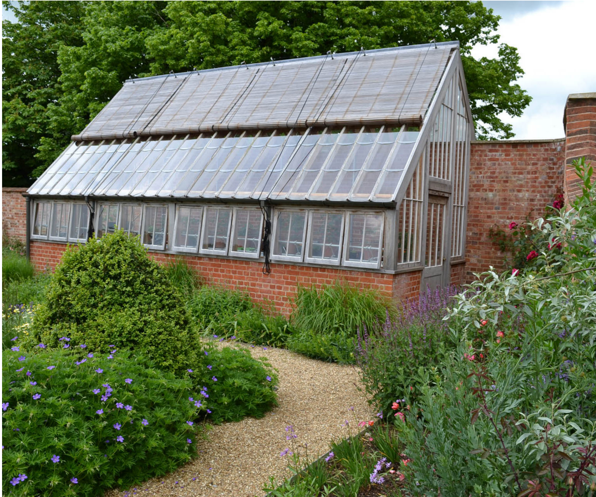
Reference image - tropical hardwood frame three-quarter pitch glasshouse on brick base (TSS project)

The proposal to the West Garden includes a new glasshouse on the inside of the new walled garden that takes advantage of the south facing and sheltered aspect.