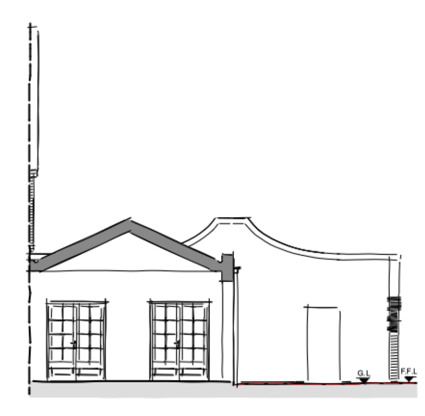
Existing Section A-A Scale 1:100