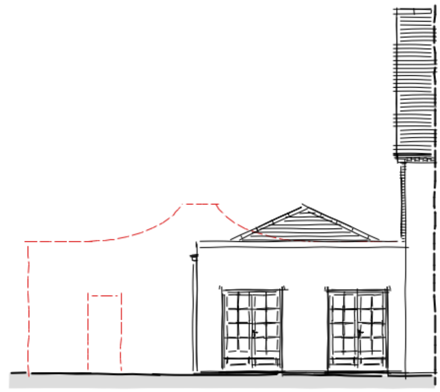
Proposed South Elevation Scale 1:100