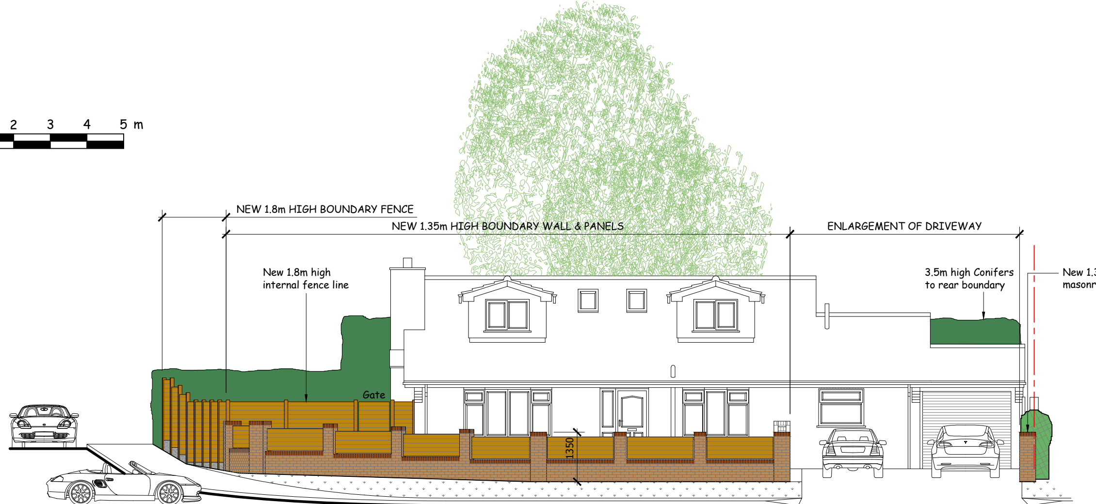
PROPOSED BOUNDARY ELEVATION FROM HOLTBY LANE