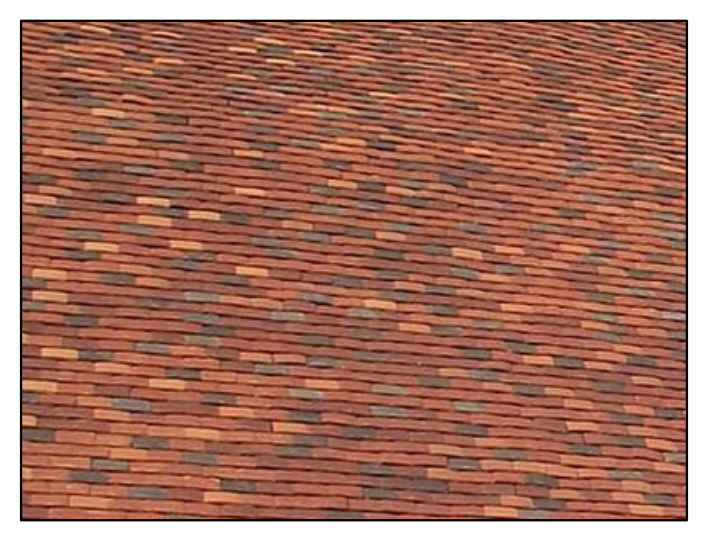
PLOT 2 : Lifestiles Clay Plain Tiles - Handmade Multi.