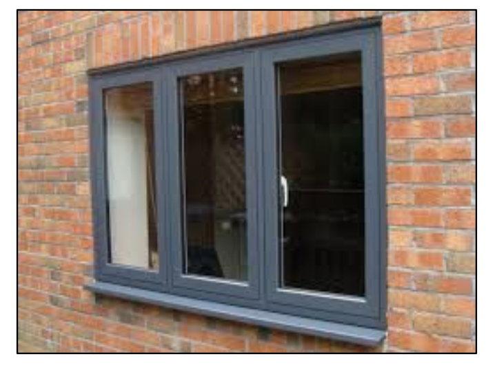
PLOTS 3 & 4 : Traditional flush casement styled anthracite grey uPVC windows

JAAP. Architects Market Hill, Clare, SUDBURY, SUFFOLK, CO10 8NN Telephone: (01787) 279490 - Email: enquiries@japarchitects.co.uk