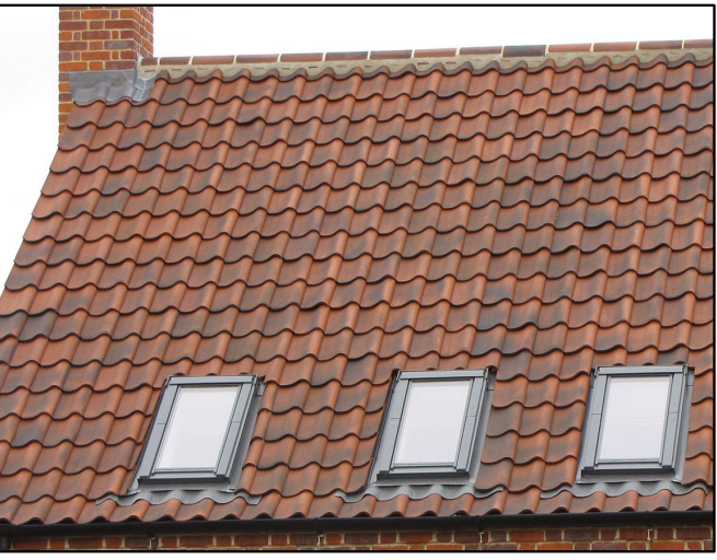
PLOTS 3 & 4 and Garage Outbuildig : Lifestiles Ashvale Restoration Clay Pantiles.