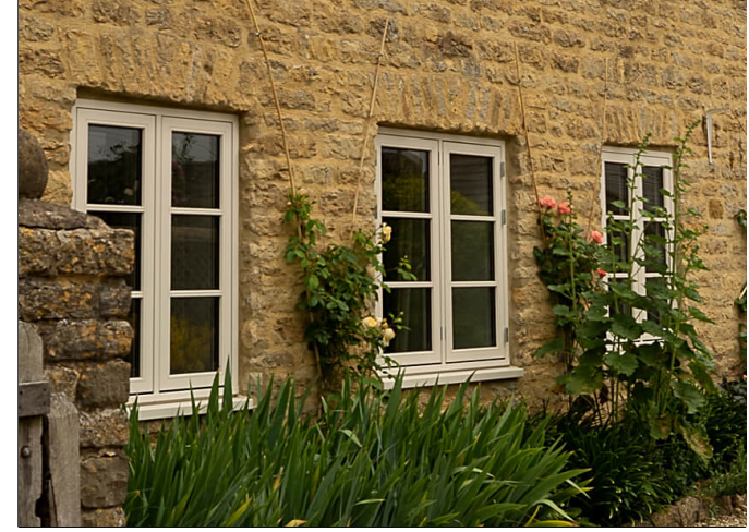
PLOT 2 & Garages : Traditional flush casement styled off white (RAL 9010) uPVC windows

Traditional Heritage styled anthracite grey uPVC sliding sash.