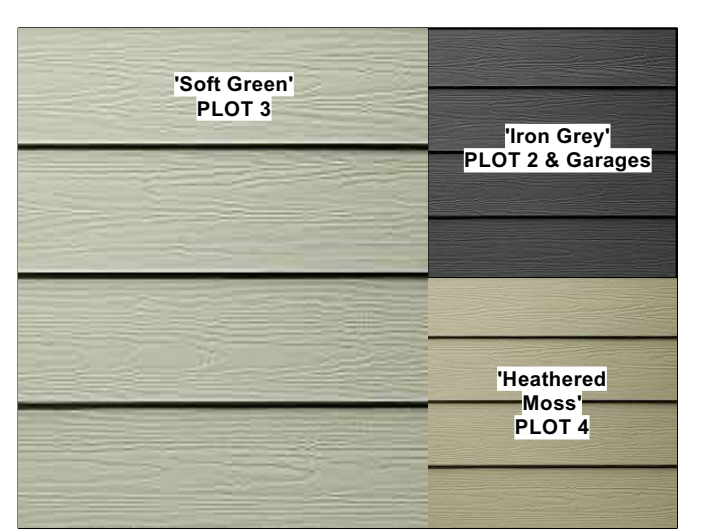
Plots 2, 3 & 4 : Hardie Plank Composite Weather Boards with Complementary shade variations