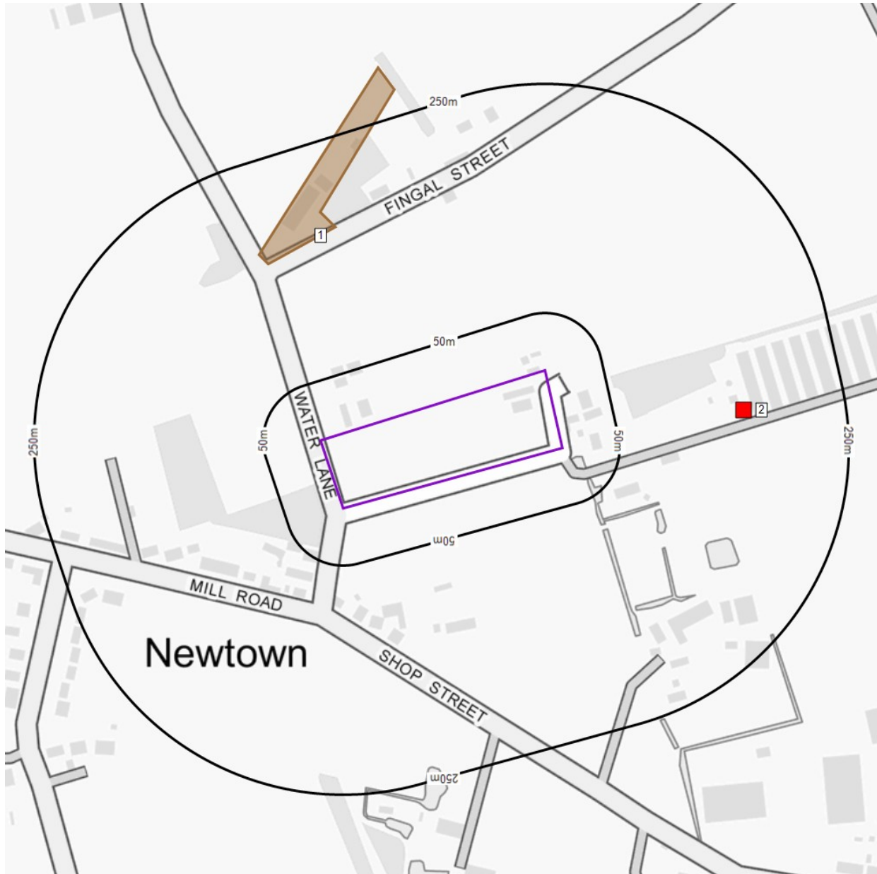
Contains Ordnance Survey data © Crown copyright and database right 2023.

The map below shows the location of potentially contaminative historical land uses that have been identified from historical maps and other sources. Further details are shown on the following pages.