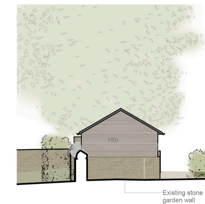
Proposed Elevation - South Outbuilding 1:100

Planning This drawing has been prepared for workstages up to planning application purposes only and is not intended for construction. The scale bar should only be used to check the drawing has been reproduced to the correct size. No responsibility can be accepted for errors made by others in scaling from this drawing.