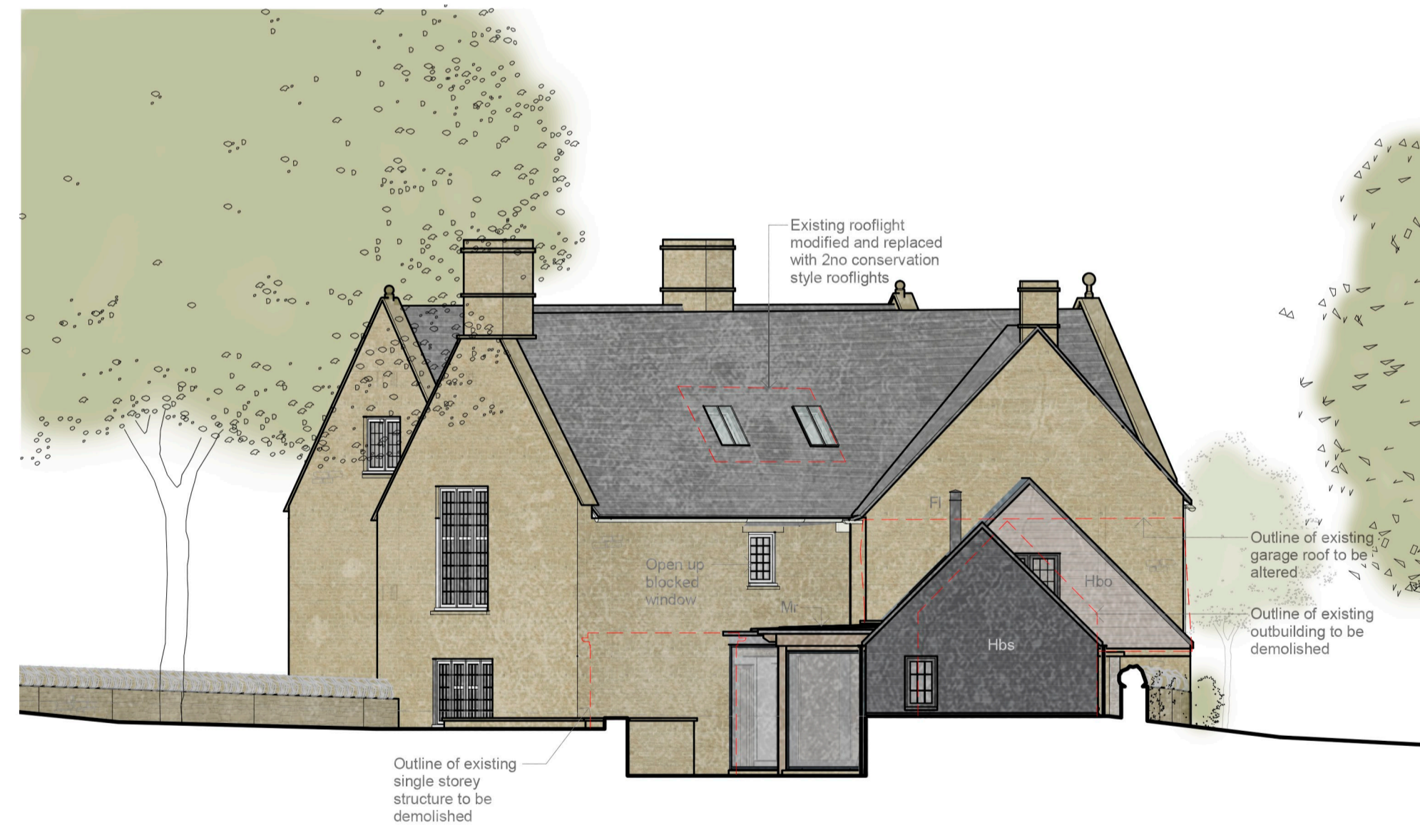
Proposed Elevation - North Extension