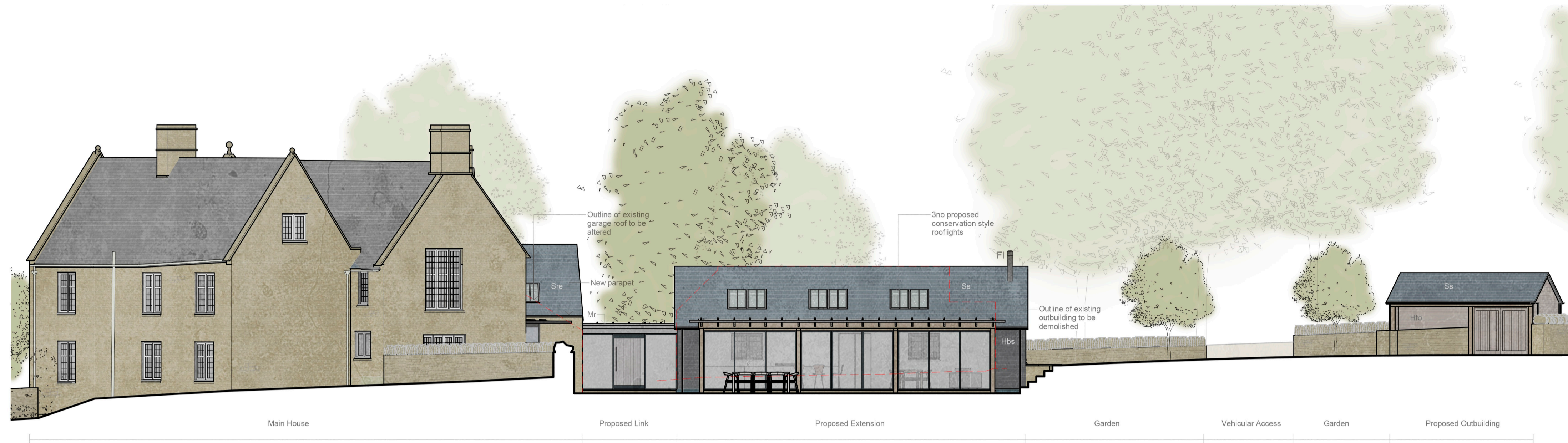
Proposed Elevation - North East 1:100