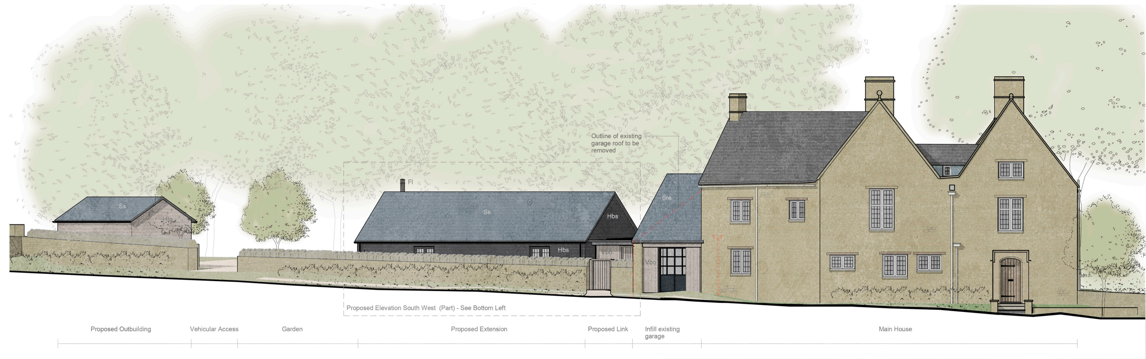
Proposed Elevation - South West 1:100