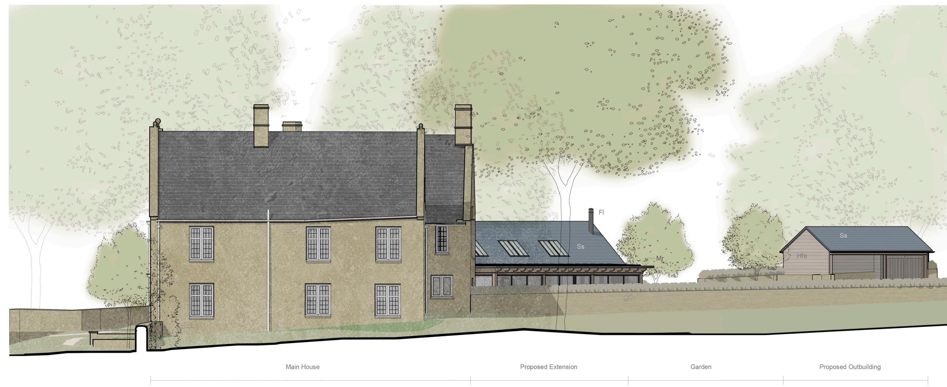
Proposed Elevation - South East