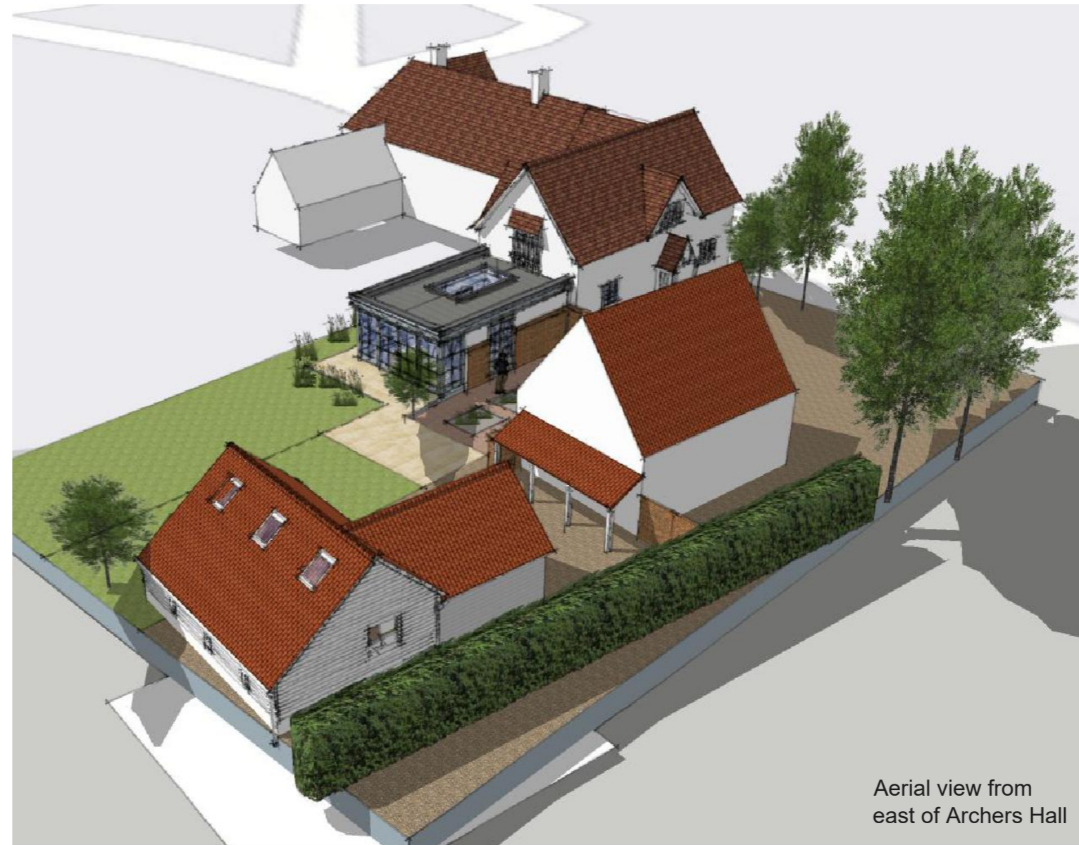
Aerial view from east of Archers Hall

'B' Revised garden wall 26.04.23 'A' Extension rooflight & brick arch 04.03.22