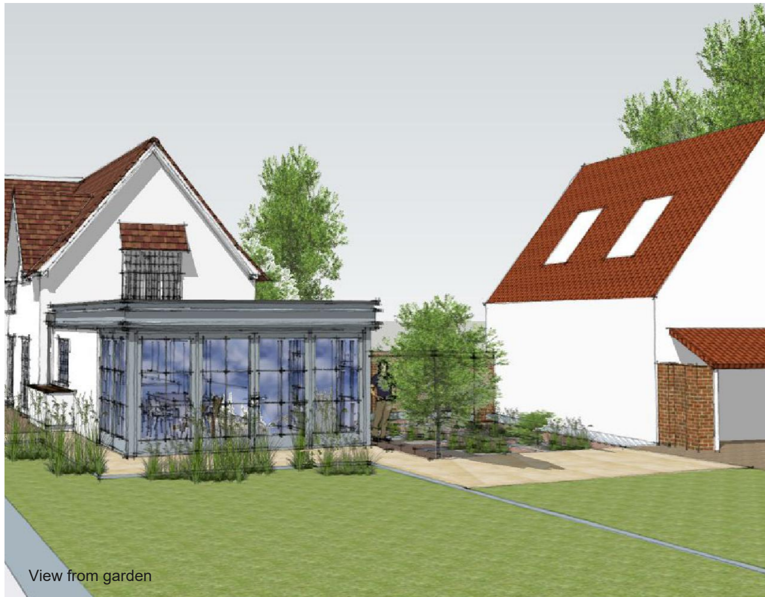
View from garden