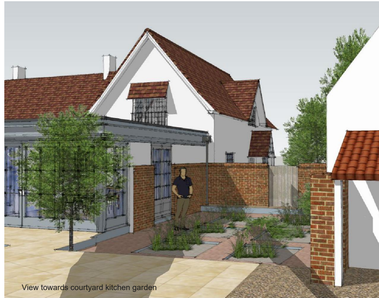
View towards courtyard kitchen garden