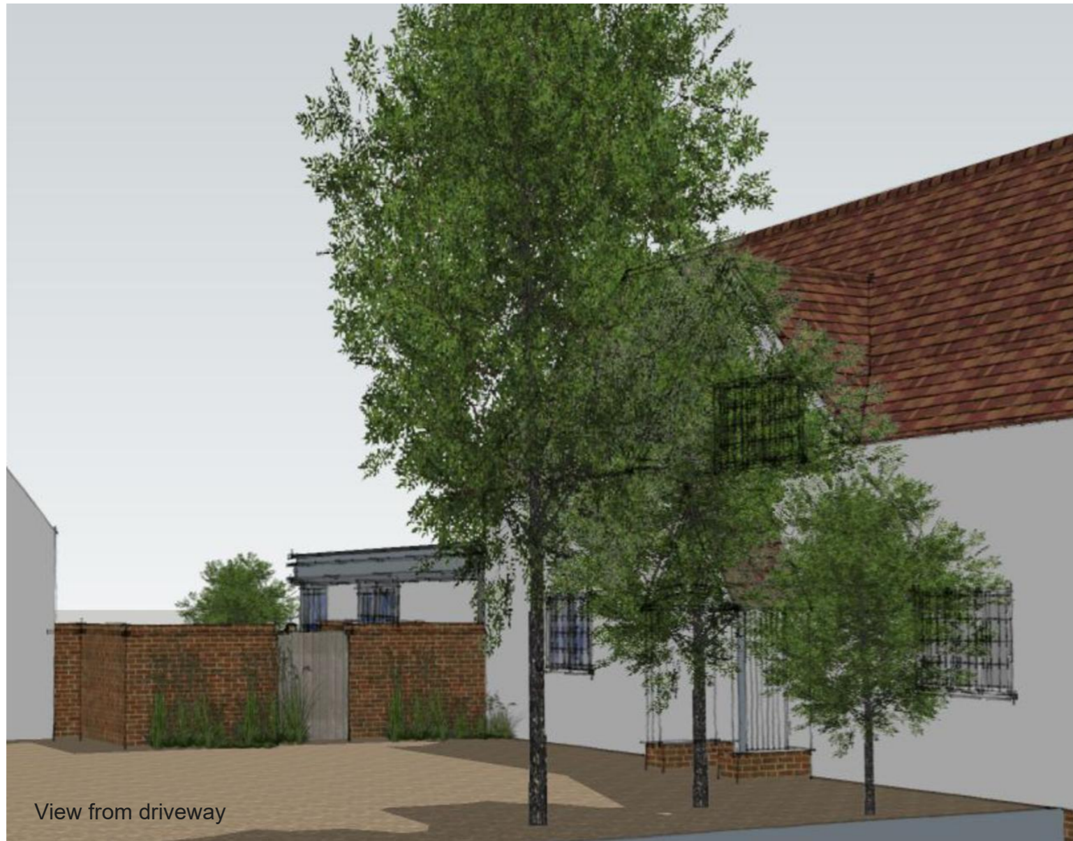
View from driveway