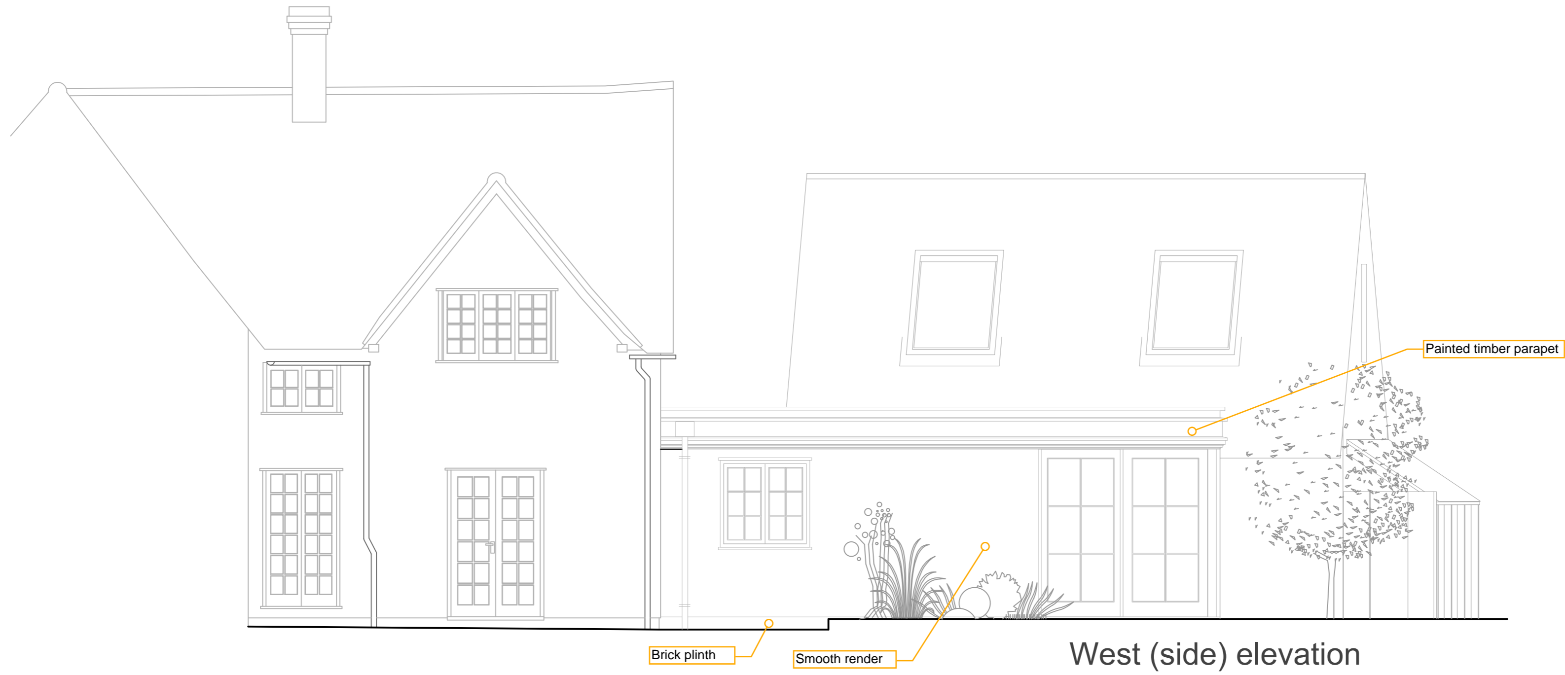
West (side) elevation