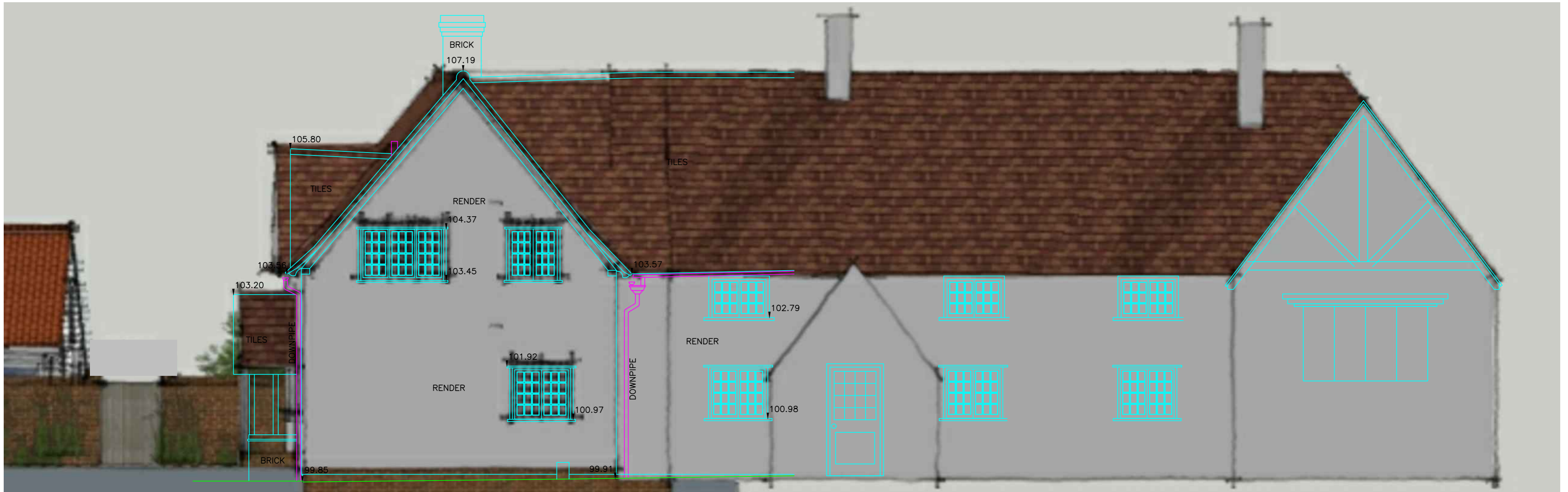
Front elevation [north] as proposed (no change top main house elevation)