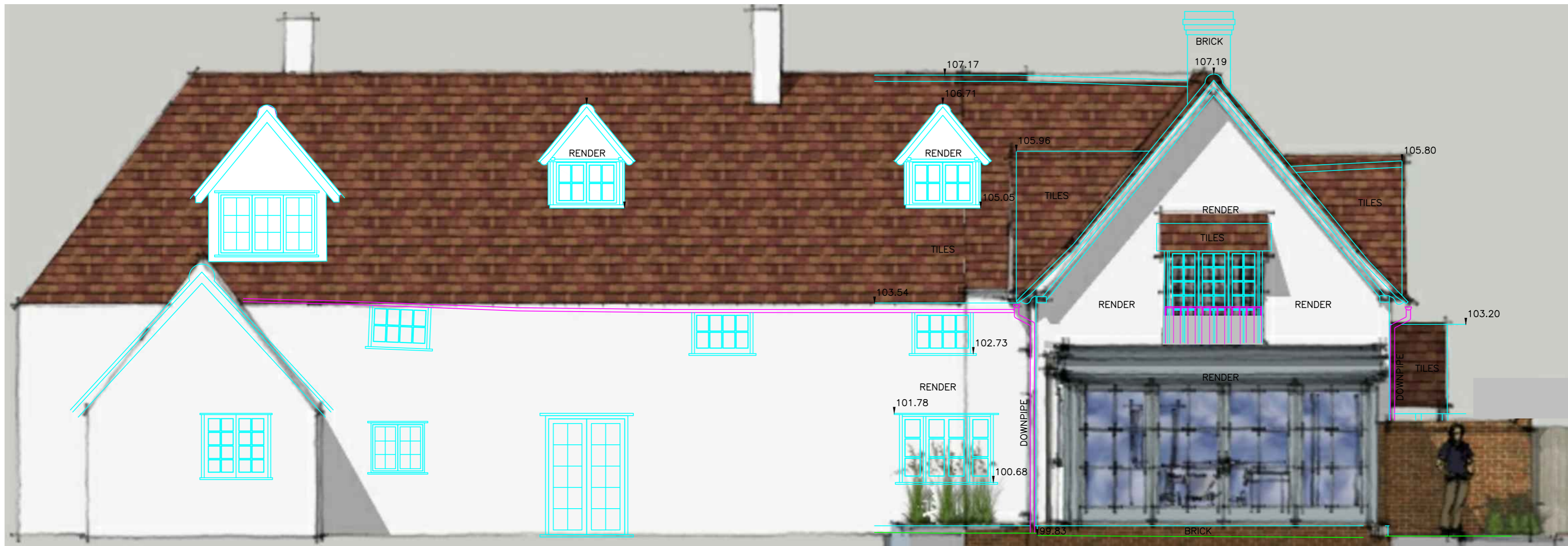
Rear elevation [south] as proposed (addition of single storey extension is the only change to the rear elevation)