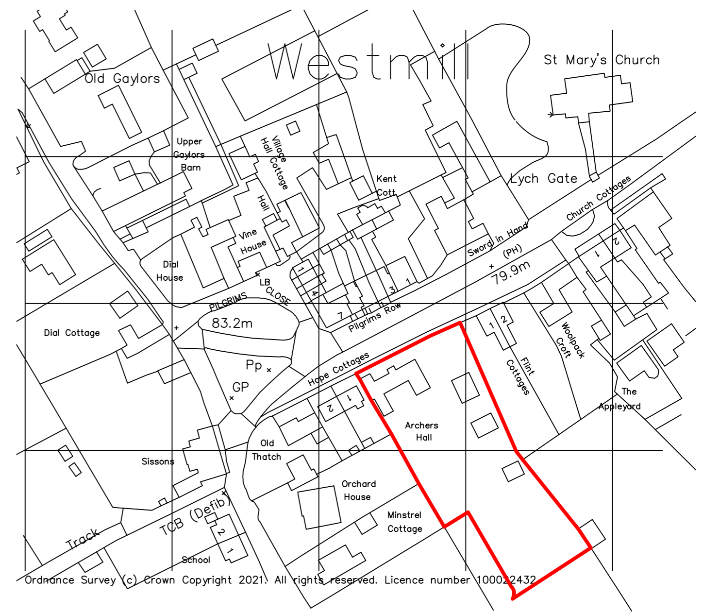
Site location as existing

'B' Garden wall revised 26.04.23 'A' Extension rooflight amended 04.03.22