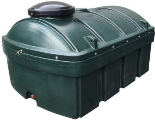
Proposed oil tank