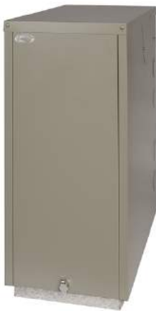
Proposed external boiler