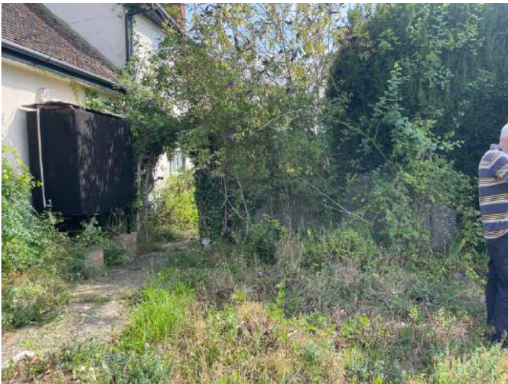
Existing oil tank to be removed