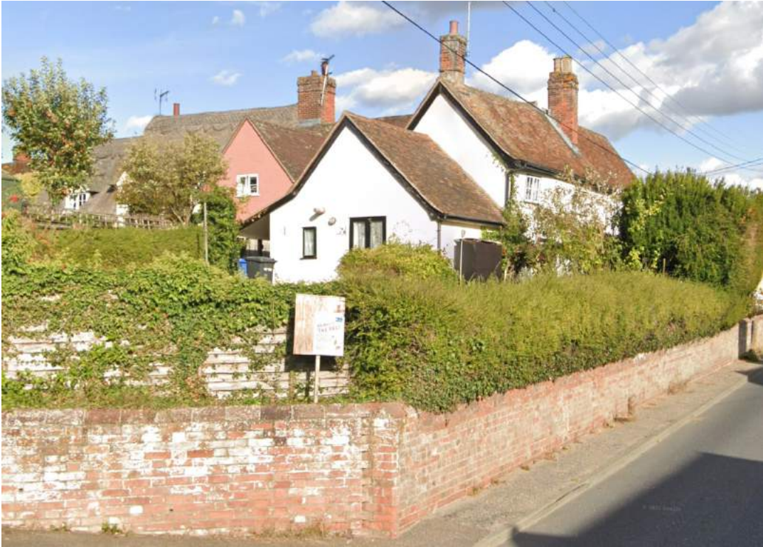
Rearside elevation of The Manse