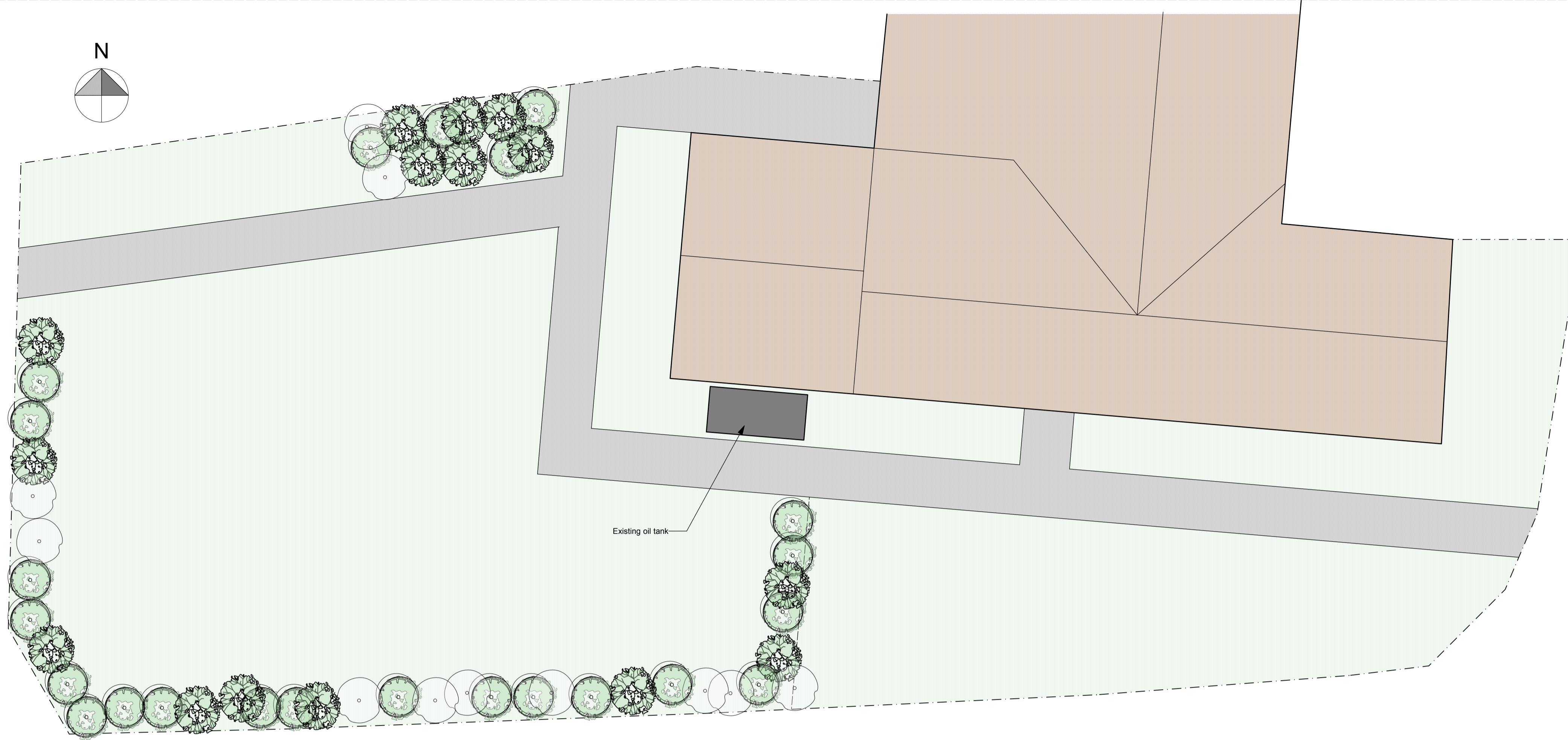
EXISTING BLOCK PLAN 1:100