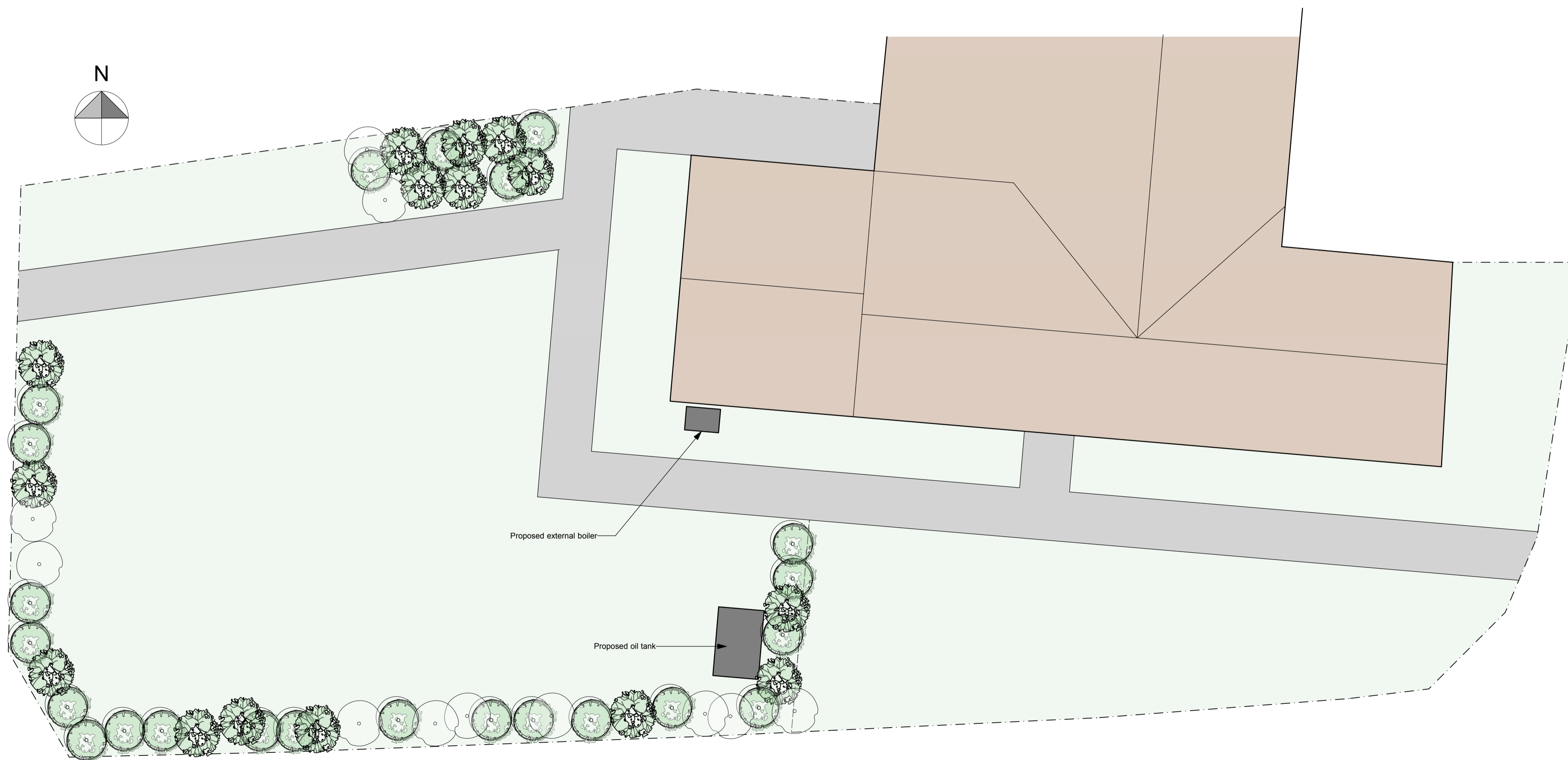
PROPOSED BLOCK PLAN 1:100