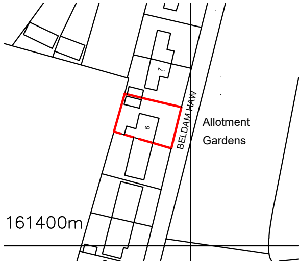
LOCATION PLAN SCALE 1 : 1250