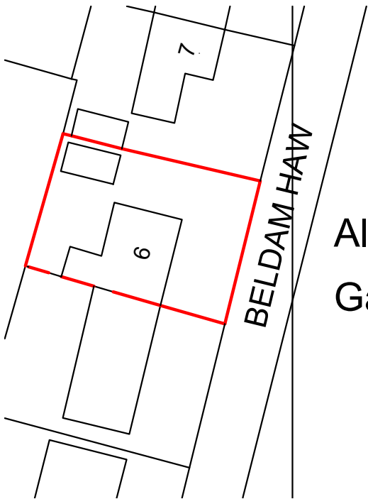
SITE PLAN SCALE 1 : 500