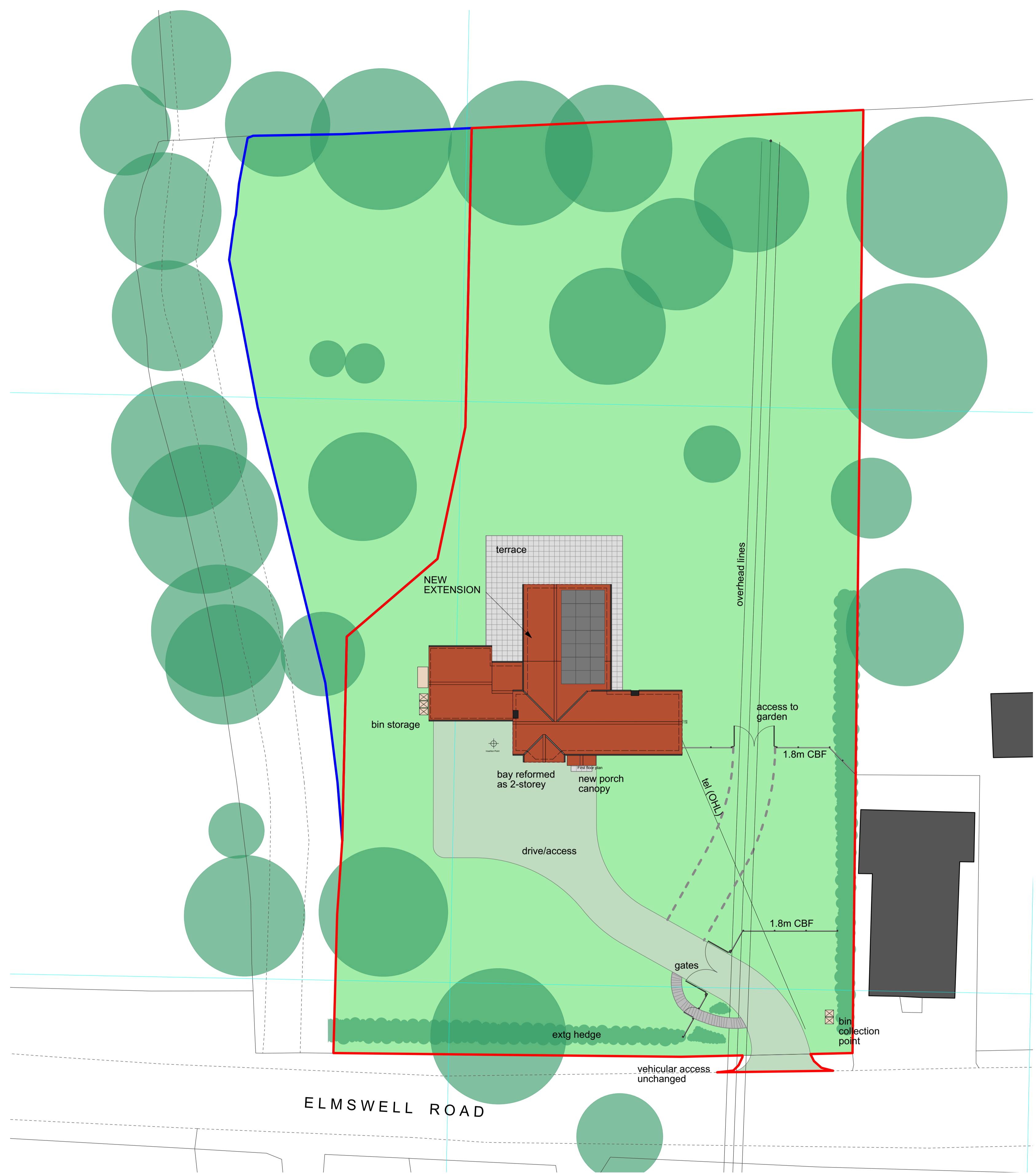
North Site Plan scale 1:200