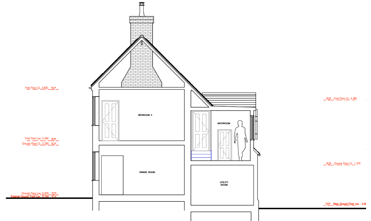
EXISTING SECTION AA