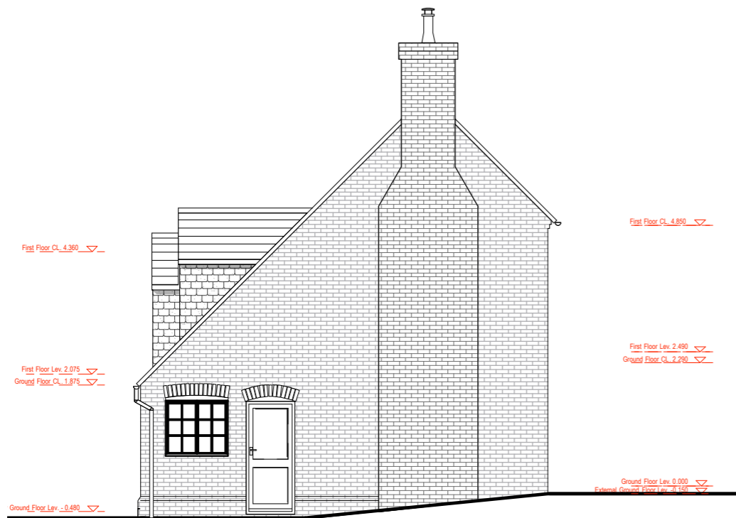
EXISTING SIDE (WEST) ELEVATION