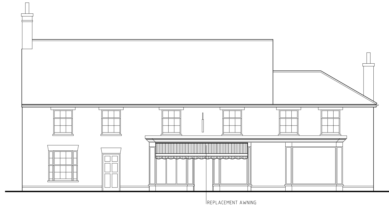
south west to the street awning extended