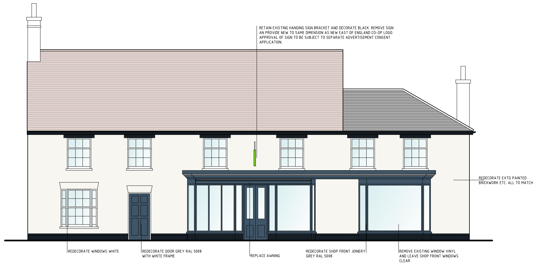
south west to the street