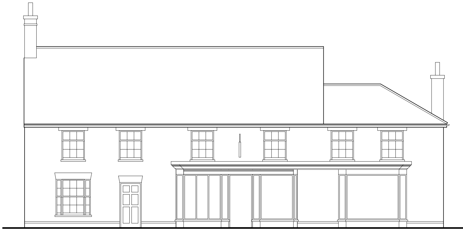
south west to the street