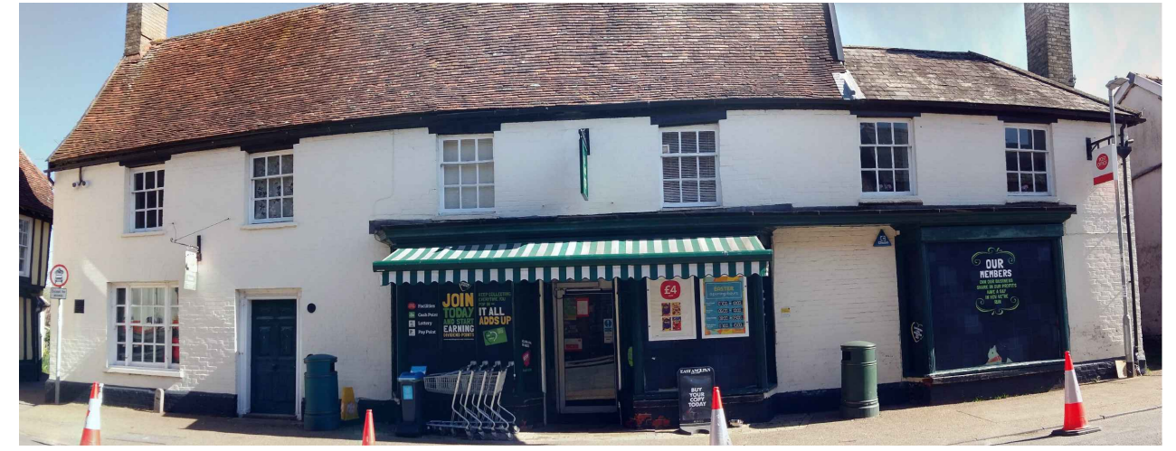
south west photo as existing