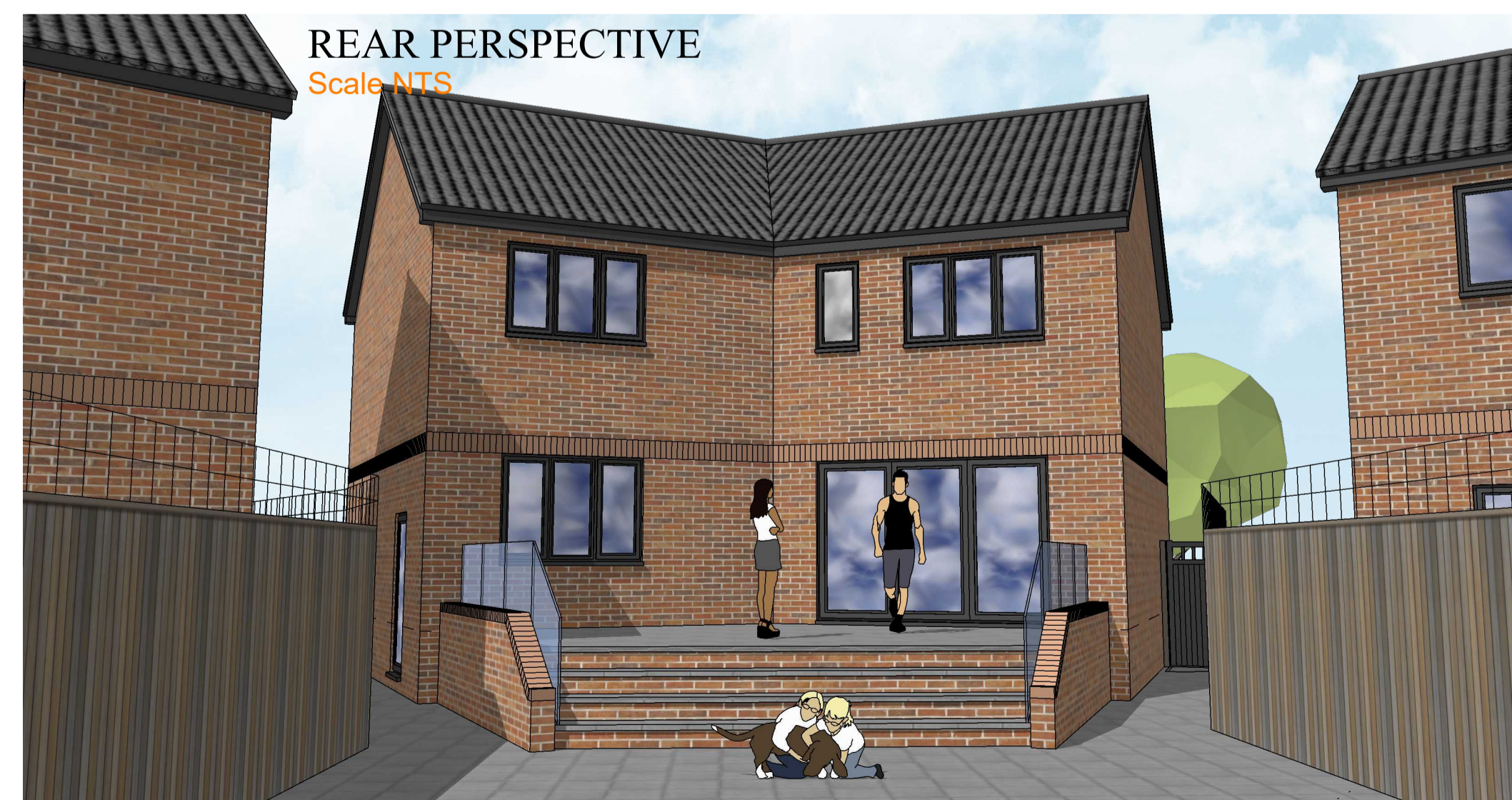
REAR PERSPECTIVE Scale NTS