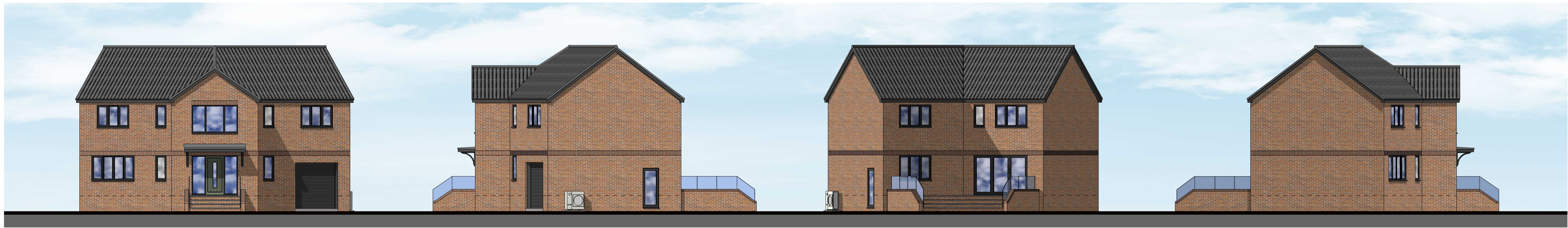
SOUTH-WEST ELEVATION Scale 1:100