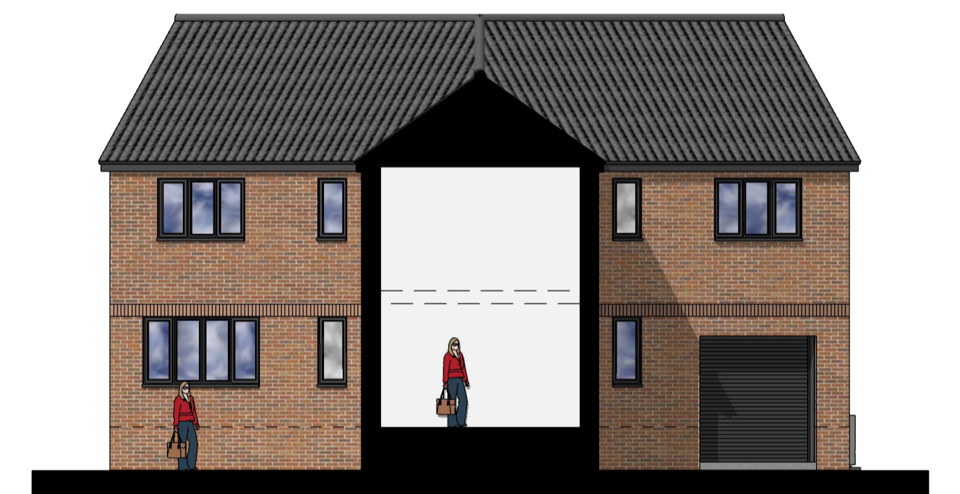
TYPICAL SECTION THRO' Scale 1:100