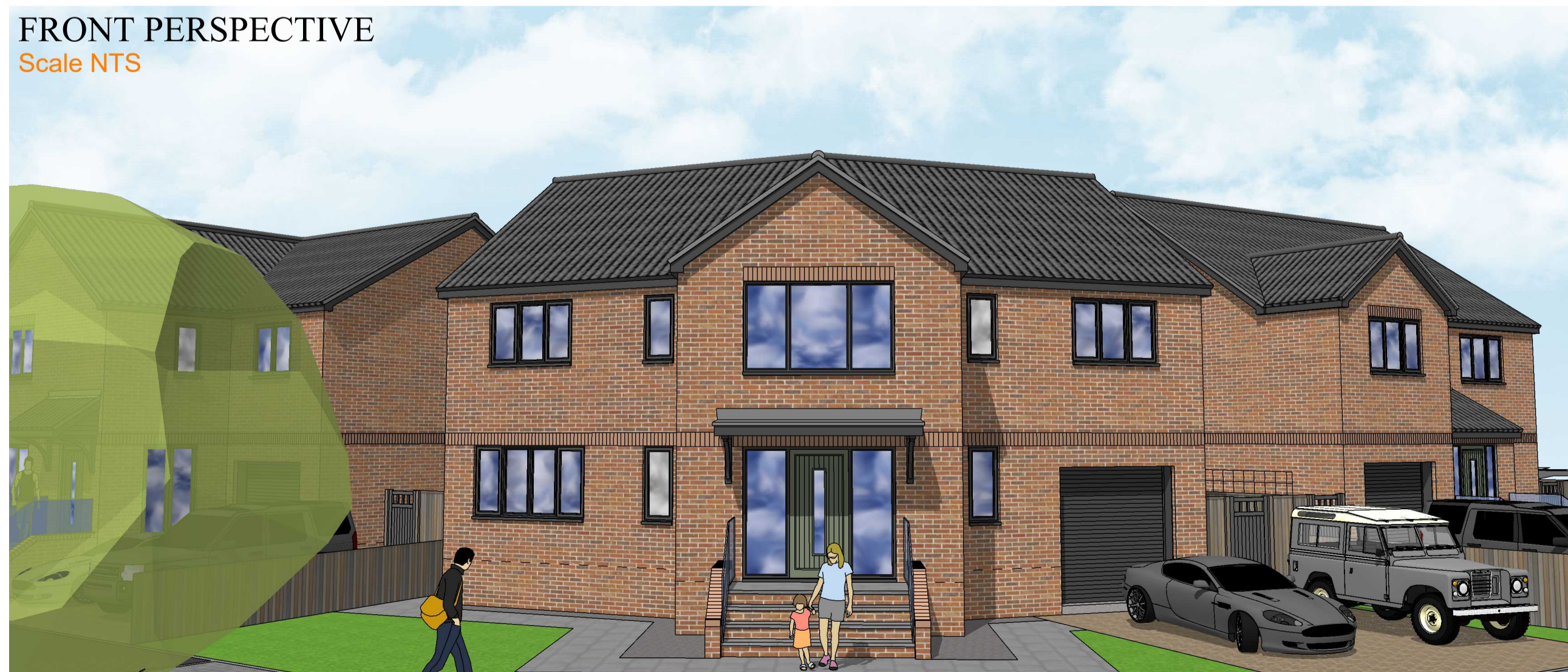
FRONT PERSPECTIVE Scale NTS