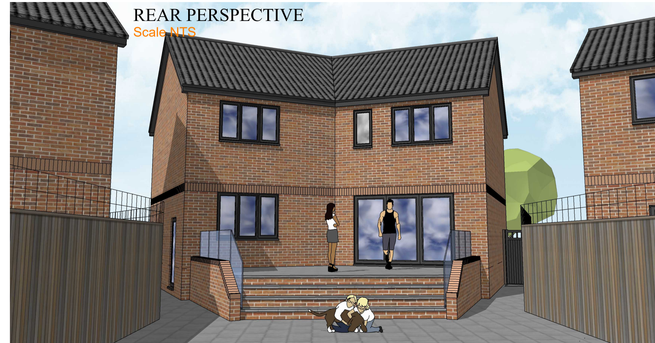
REAR PERSPECTIVE Scale NTS