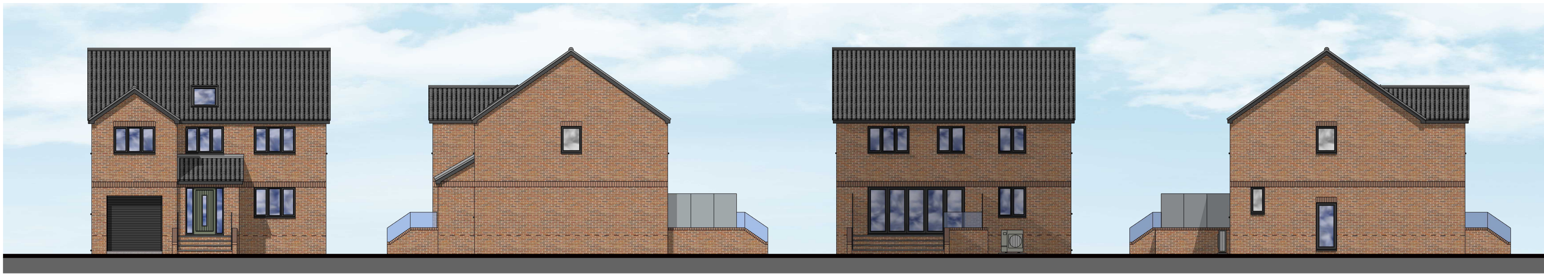
SOUTH ELEVATION Scale 1:100