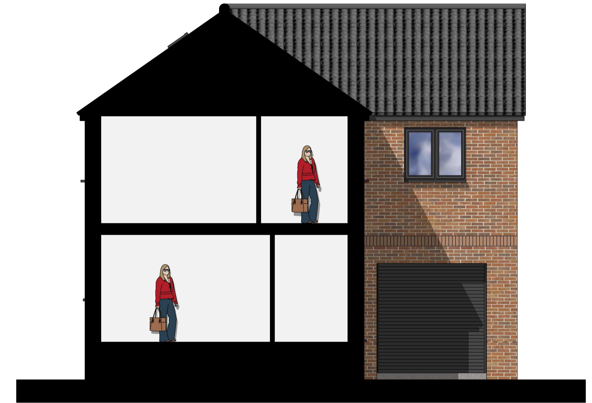
TYPICAL SECTION THRO' Scale 1:50