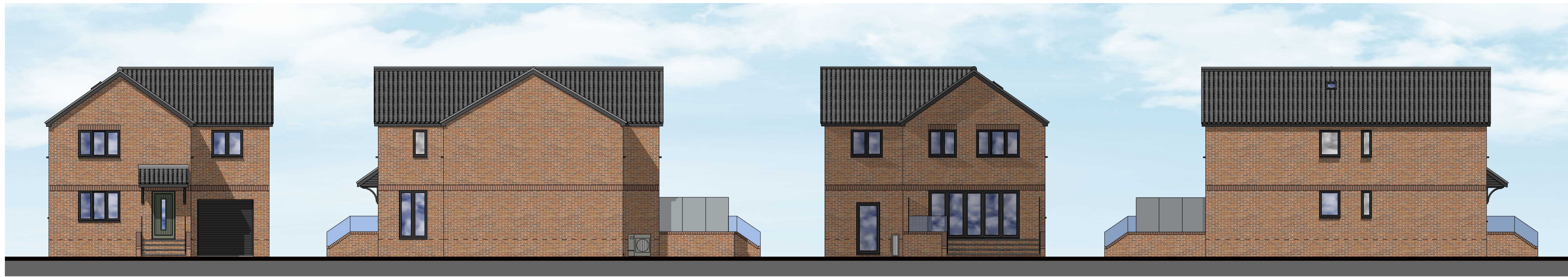
WEST ELEVATION Scale 1:100