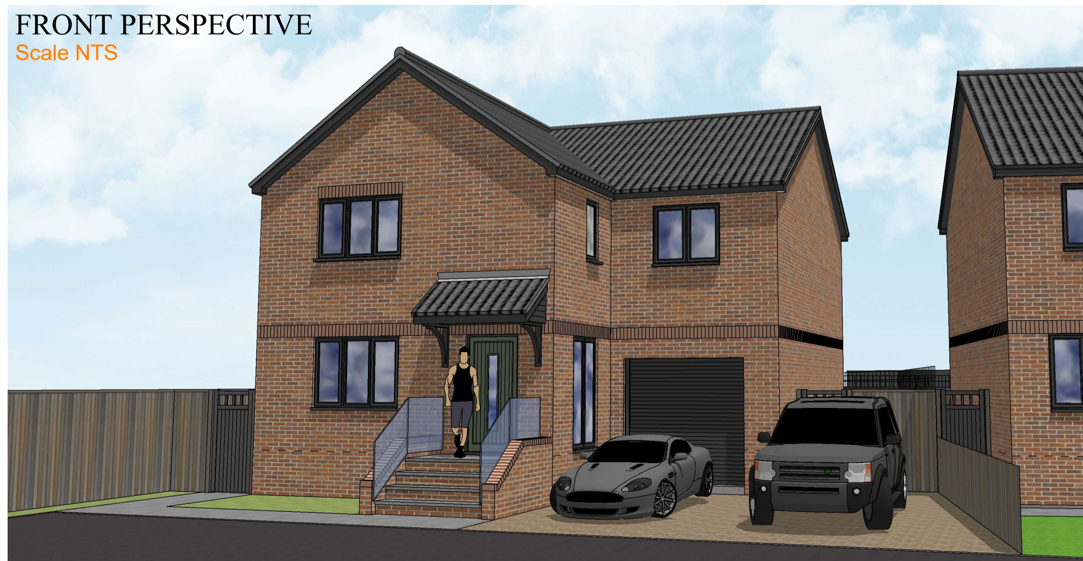
FRONT PERSPECTIVE Scale NTS