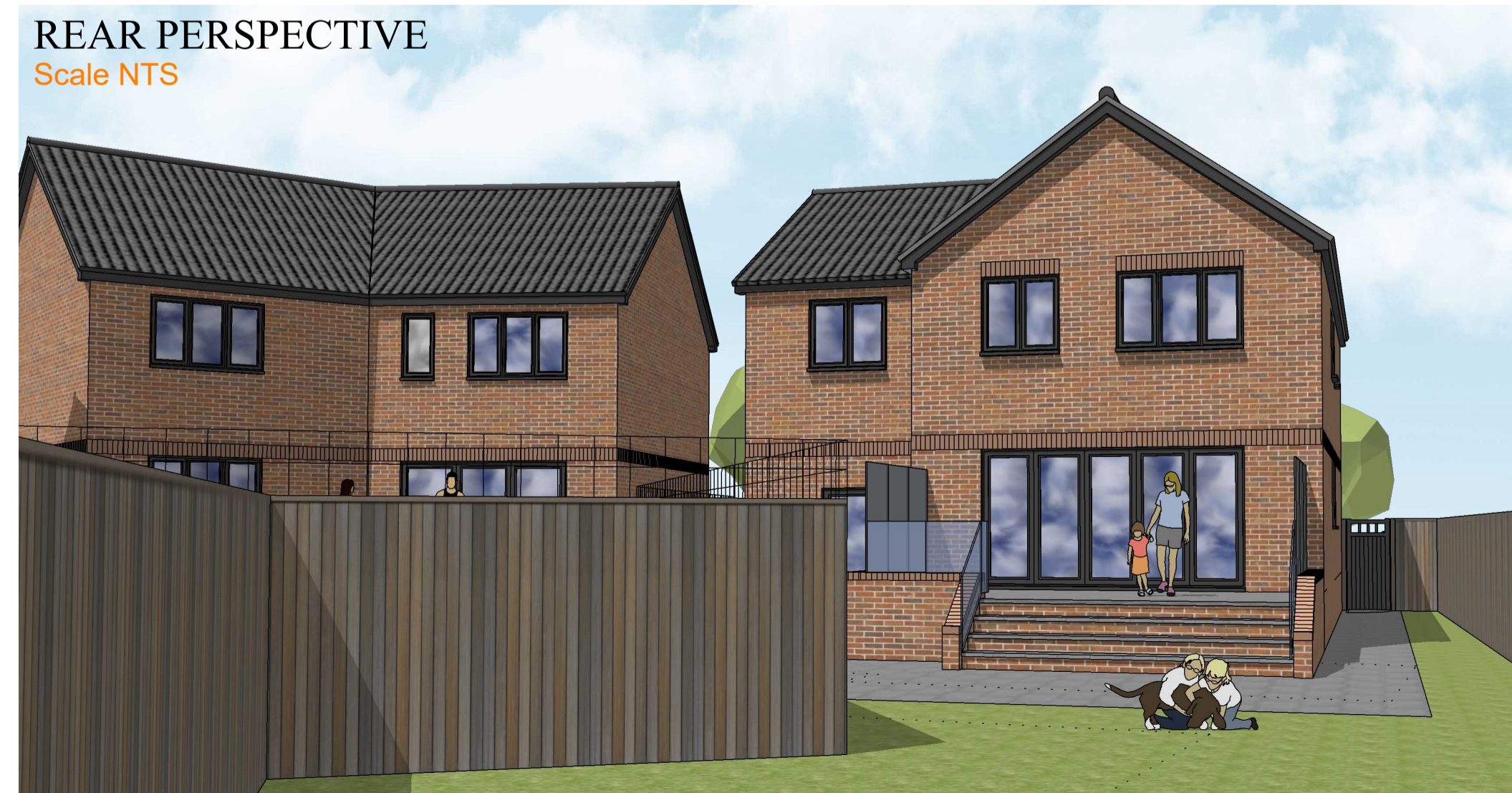
REAR PERSPECTIVE Scale NTS